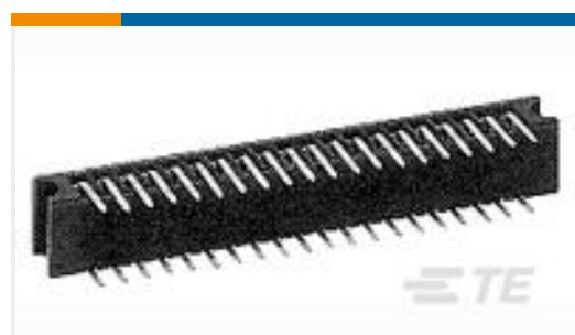
TE Part # 5-532955-8 50 MODII 2PC CE RCPT ASSY, RoH