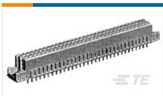
TE Part #5148460-1 ASSY,RECPT,EUROCARD,TYPE C,L- FREE,144/15