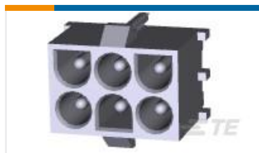
TE Part #194002-1 PIN ASSY..070