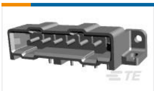
TE Part #207378-7 METRIMATE PIN HEADER ASSY,6P