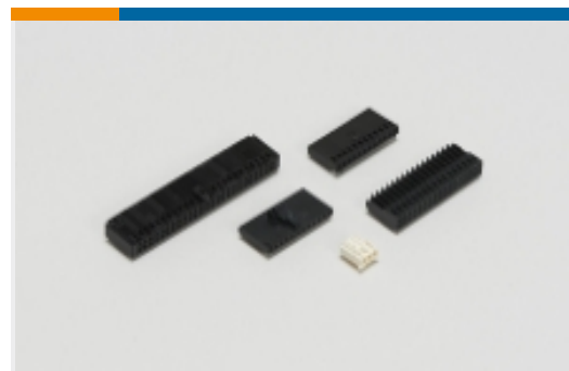
Wire-to-Board Connector Assemblies & Housings(5)