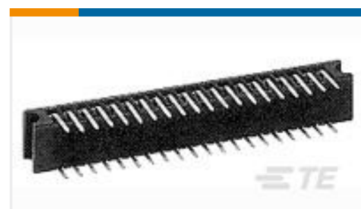
TE Part # 6-534975-1 50 MODII 2PC DR CE RECPT ASSY, RoHS