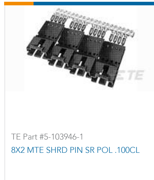
TE Part #5-103946-1 8X2 MTE SHRD PIN SR POL .100CL