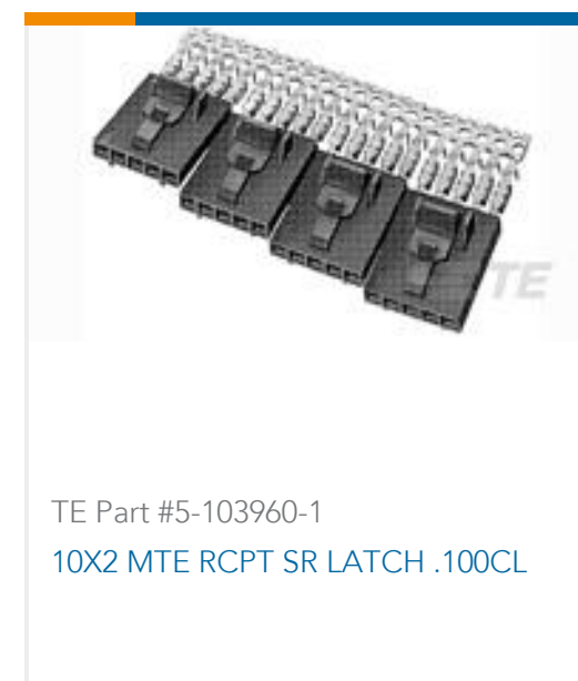
TE Part #5-103960-1 10X2 MTE RCPT SR LATCH .100CL