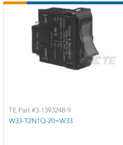
TE Part #3-1393248-9 W33-T2N1Q-20=W33