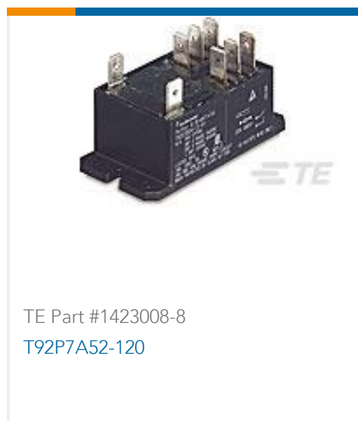
TE Part #1423008-8 T92P7A52-120