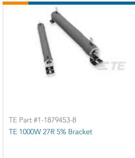
TE Part #1-1879453-8 TE 1000W 27R 5% Bracket