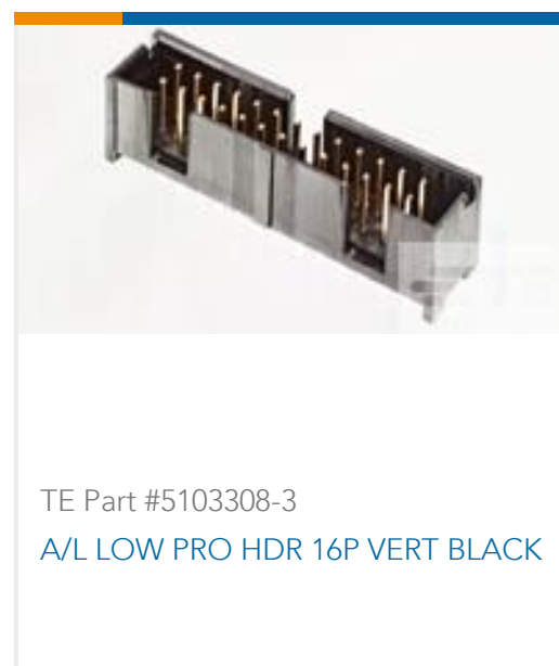
TE Part #5103308-3 A/L LOW PRO HDR 16P VERT BLACK