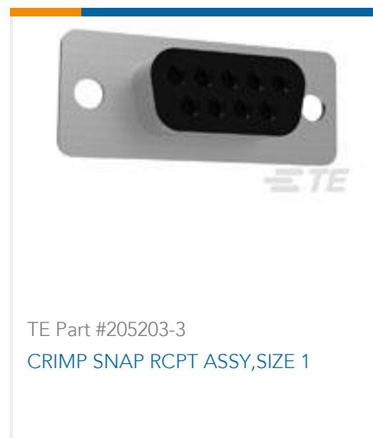
TE Part #205203-3 CRIMP SNAP RCPT ASSY,SIZE 1