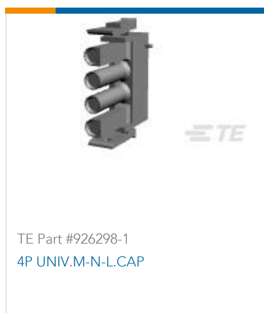
TE Part #926298-1 4P UNIV.M-N-L.CAP