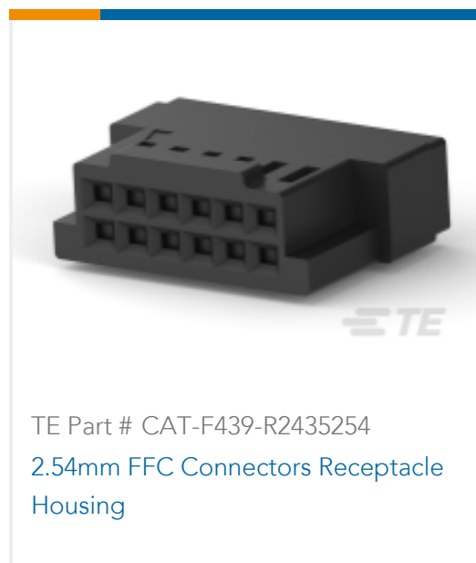
TE Part # CAT-F439-R2435254 2.54mm FFC Connectors Receptacle Housing