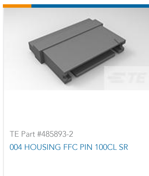
TE Part #485893-2 004 HOUSING FFC PIN 100CL SR