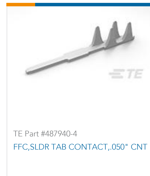
TE Part #487940-4 FFC,SLDR TAB CONTACT,.050" CNT