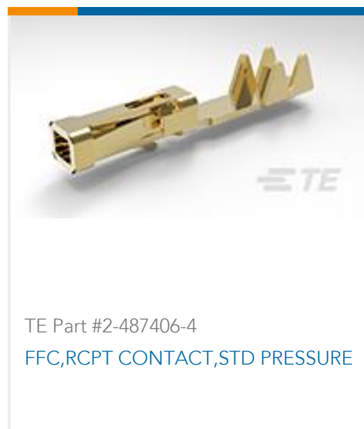
TE Part #2-487406-4 FFC,RCPT CONTACT,STD PRESSURE