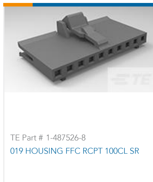
TE Part # 1-487526-8 019 HOUSING FFC RCPT 100CL SR