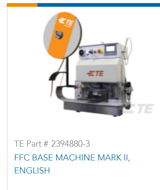
TE Part # 2394880-3 FFC BASE MACHINE MARK II, ENGLISH