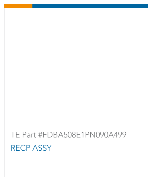
TE Part #FDBA508E1PN090A499 RECP ASSY