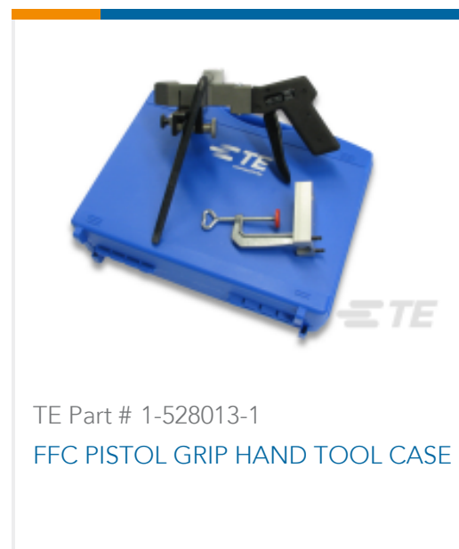
TE Part # 1-528013-1 FFC PISTOL GRIP HAND TOOL CASE