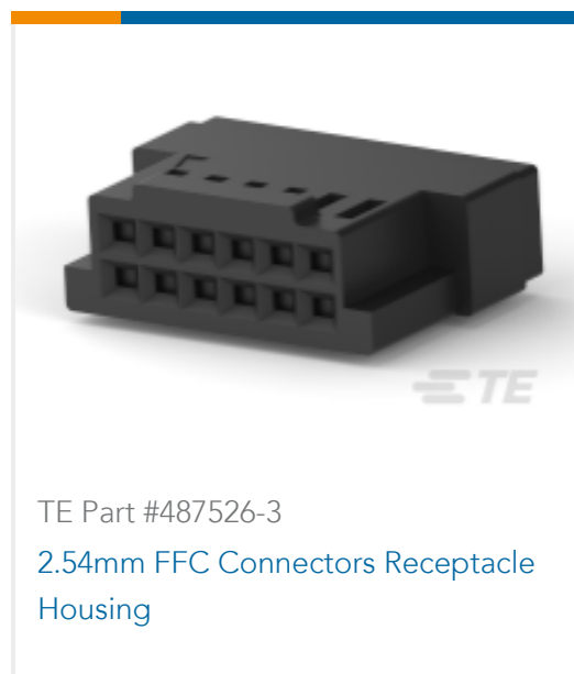
TE Part #487526-3 2.54mm FFC Connectors Receptacle Housing