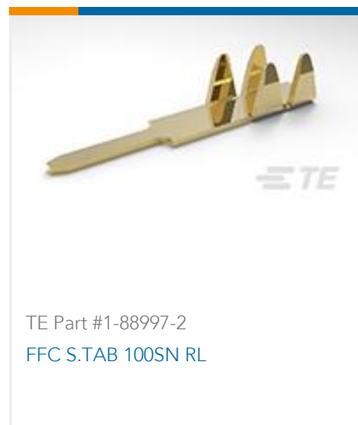
TE Part #1-88997-2 FFC S.TAB 100SN RL