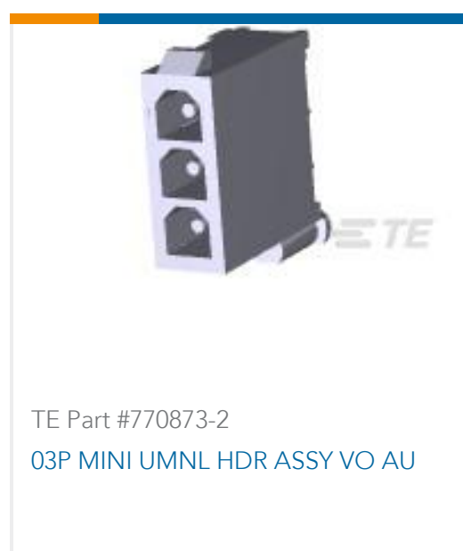
TE Part #770873-2 03P MINI UMNL HDR ASSY VO AU