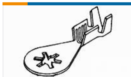
TE Part #61795-1 RING 18-14 AWG TPST