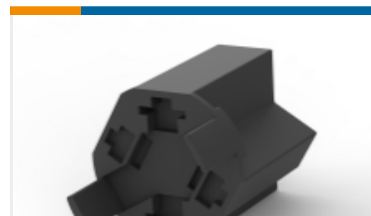
TE Part #1969725-1 187 FAST&110 PL HSG.,REC.,4 POS, BLACK