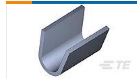
TE Part #62754-1 SPLICE 14000-30000 .030 BR