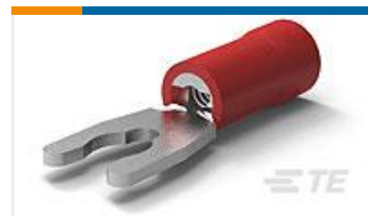
TE Part #52949-3 PG SPR SPD 22-16COMM 22-18MIL6