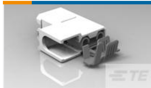
TE Part #521282-2 ULTRA-POD 250 ASSY REC 18-14 AWG TPBR