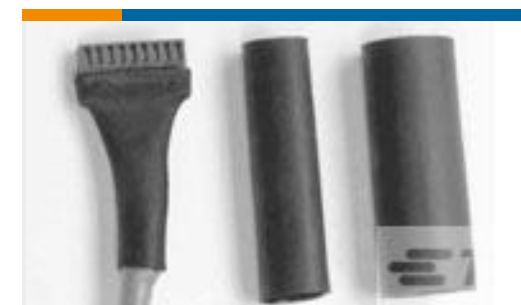
TE Part #105035-000 DWP-125-1/4-0-1.5IN