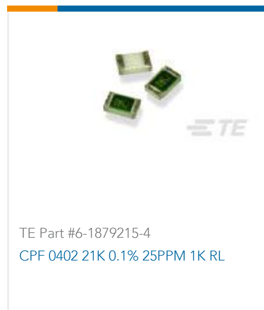
TE Part #6-1879215-4 CPF 0402 21K 0.1% 25PPM 1K RL