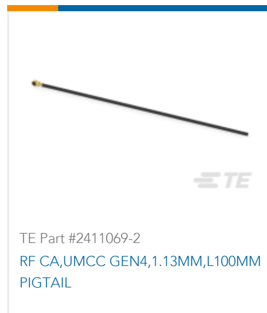
TE Part #2411069-2 RF CA,UMCC GEN4,1.13MM,L100MM PIGTAIL