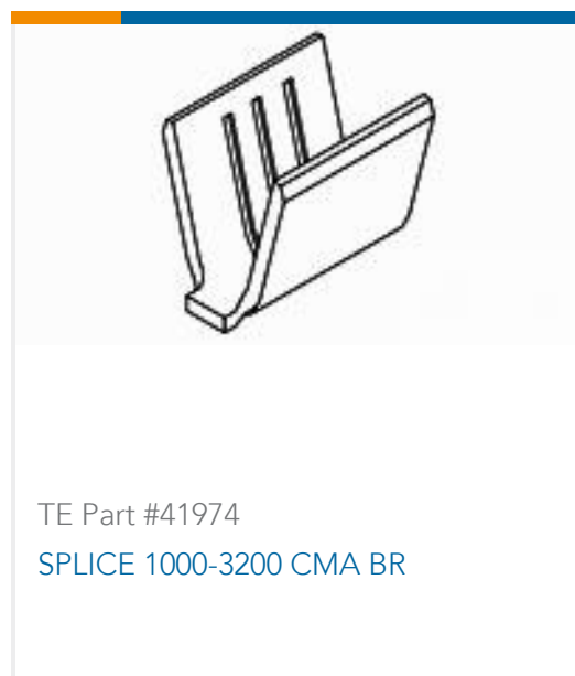
TE Part #41974 SPLICE 1000-3200 CMA BR