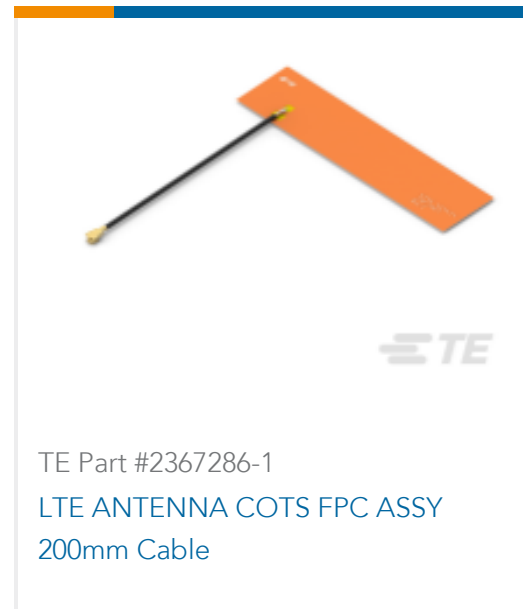
TE Part #2367286-1 LTE ANTENNA COTS FPC ASSY 200mm Cable