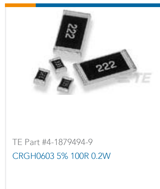
TE Part #4-1879494-9 CRGH0603 5% 100R 0.2W