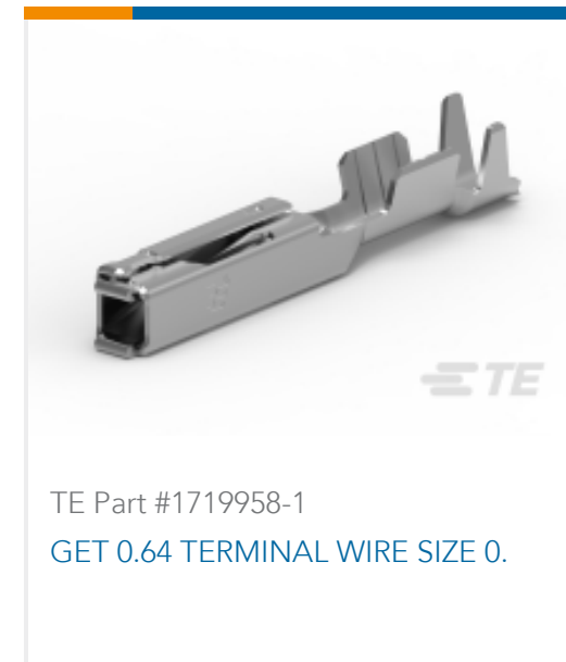
TE Part #1719958-1 GET 0.64 TERMINAL WIRE SIZE 0.