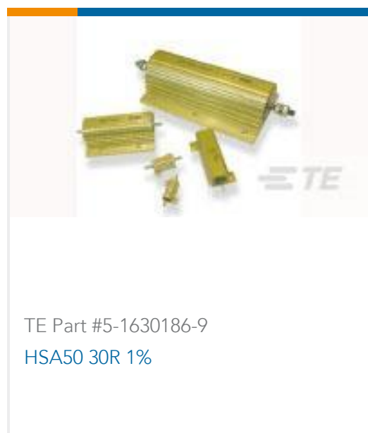
TE Part #5-1630186-9 HSA50 30R 1%