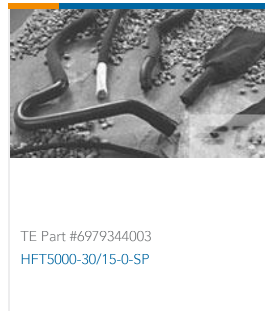
TE Part #6979344003 HFT5000-30/15-0-SP