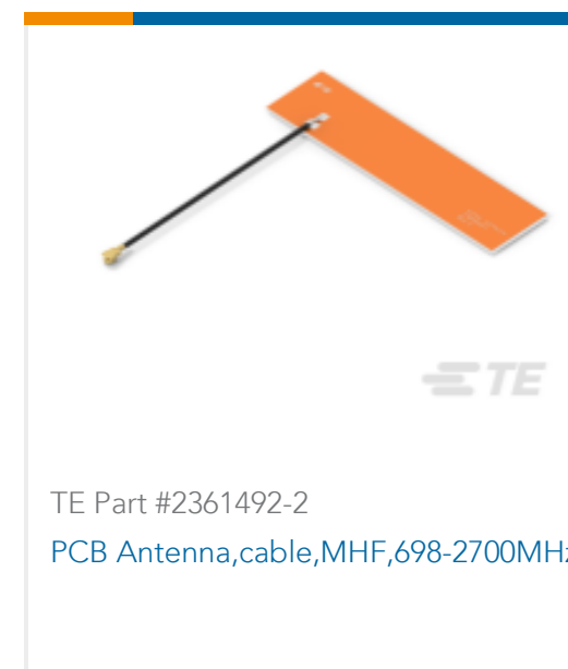
TE Part #2361492-2 PCB Antenna,cable,MHF,698-2700MHz