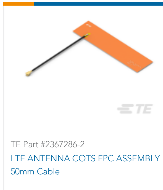
TE Part #2367286-2 LTE ANTENNA COTS FPC ASSEMBLY 50mm Cable