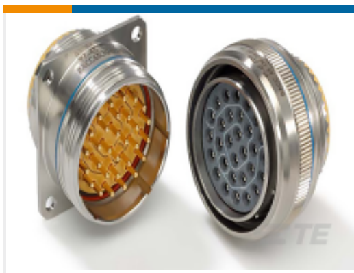
TE Part #ZPF000000000008538 983-6S 10-05 S6