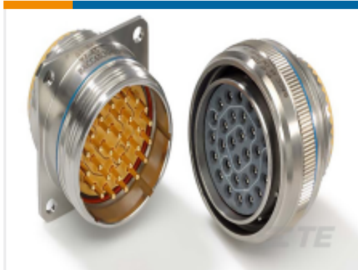
TE Part #ZPF000000000008680 983-6S 22-19 PN-L