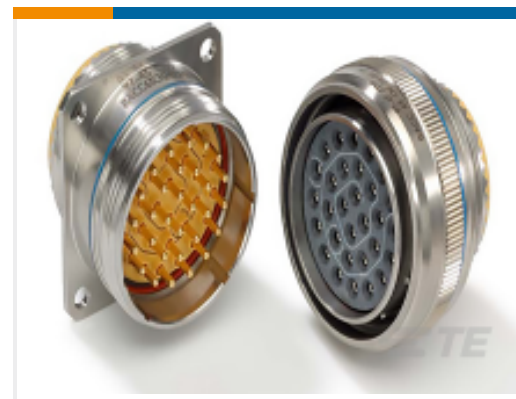
TE Part #ZPF000000000008545 983-6S 10-05 S8