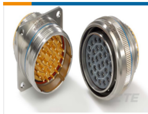
TE Part #ZPF000000000008542 983-6S 10-05 S7