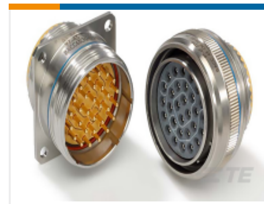
TE Part #ZPF000000000008547 983-6S 10-05 S9