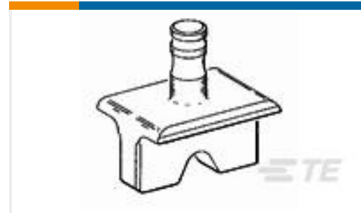
TE Part #48130 HYP8 SOLIS 2AWG NEST