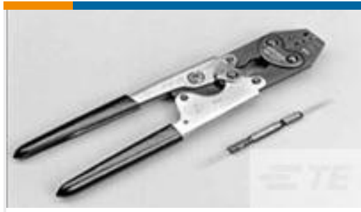
TE Part #959025-000 AD-1377-S-SPEC-CRIMP-TOOL