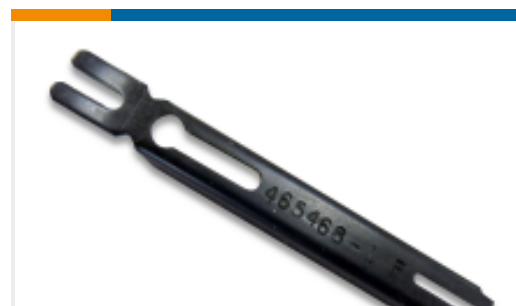
TE Part #465468-1 INSERTION TOOL TIP