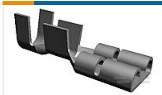
TE Part #63475-1 187 FASTON REC 20-16 AWG BR