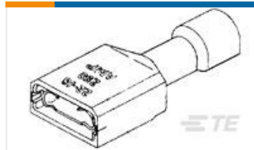
TE Part #2-520405-2 ULTRA-FAST 250 ASY REC 22-18 TPBR