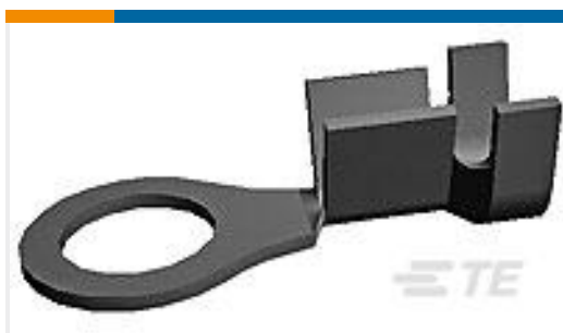
TE Part #42037-2 RING TERMINAL 22-18 AWG TPBR