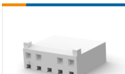
TE Part #647344-3 03P SL156 HSG W/RP TB BLK #3