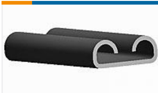
TE Part #61810-2 FASTON .250 (6.3 MM) RECEPTACLE TPBR