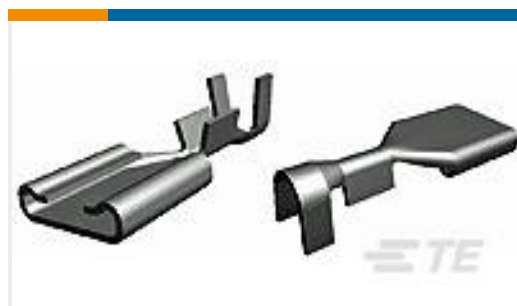
TE Part #42743-1 250 FASTON REC 22-18 AWG BR