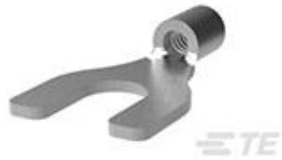
TE Part #36195 SOLIS SPD 22-16COMM 22-18MIL 6