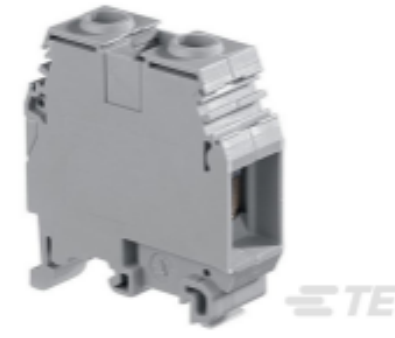
TE Part #1SNA115124R0700 M35/16