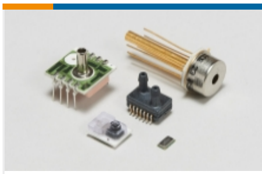
Board Mount Pressure Sensors(35)