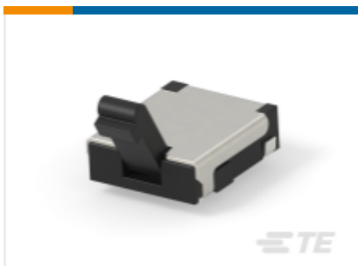
TE Part #2331413-1 DET SW4.2X3.6X1.2 JB VERT(DW) NO AGAU RL