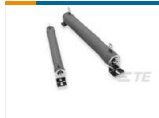
TE Part #3-1879457-9 TE 2500W 1K5 5% Bracket