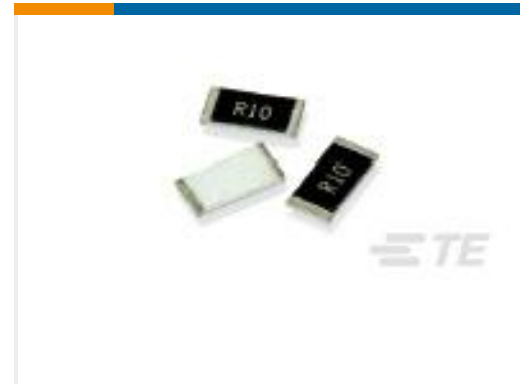
TE Part #3-2176050-1 RLP73K 1E R91 5% 5K RL