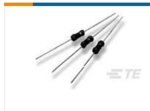
TE Part #5-1879353-3 RR02 5% 620K AMMO