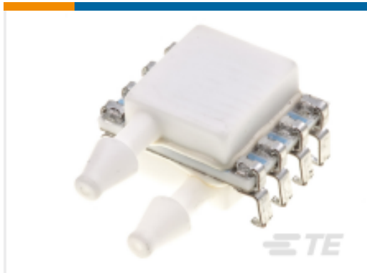
TE Part #4515DO-DS3BK020DPL 20IN PCB MOUNT I2C DIFF PRESSURE SENSOR