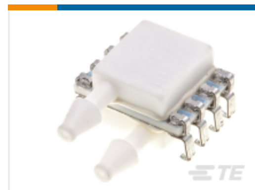
TE Part #4525-DS3A001DP 1PSI DP PRESSURE SENSOR 10% TO 90%