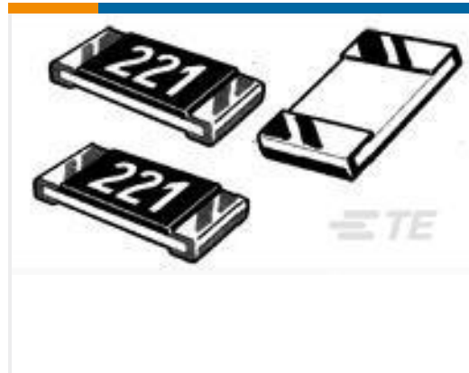
TE Part #1622820-2 3520 100R 5%