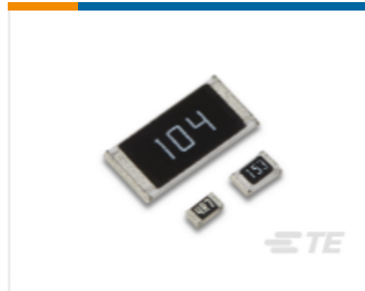
TE Part #4-2176349-3 CRGCO 2512 33K 1%