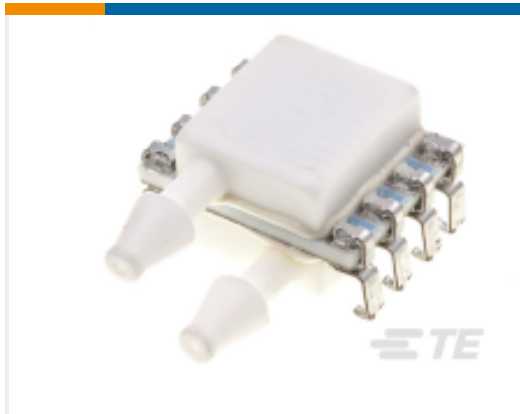
TE Part #4525DO-DS5AI001DP 1IN PCB MOUNT I2C DIFF PRESSURE SENSOR