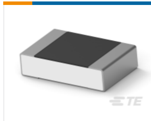
TE Part #5-2176376-1 RQ 0805 41K2 0.1% 10PPM 1K RL