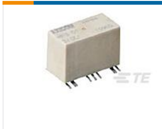
TE Part #1462050-1 HF301=75OHM140MW 3V MONO