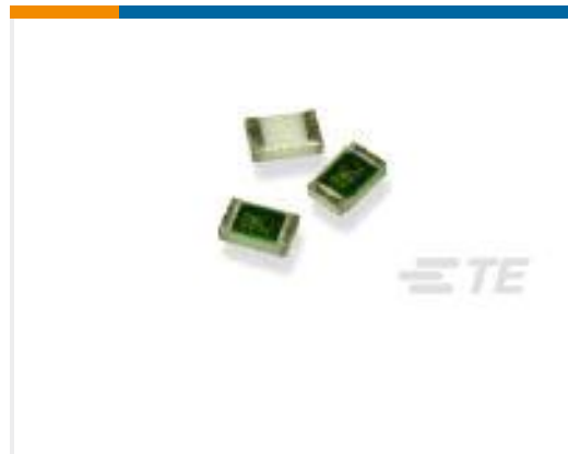
TE Part #4-1614891-1 CPF 0805 187R 0.1% 25PPM 1K RL