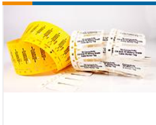
TE Part #A83925-000 CM-SCE-TP-1/2-6H-9