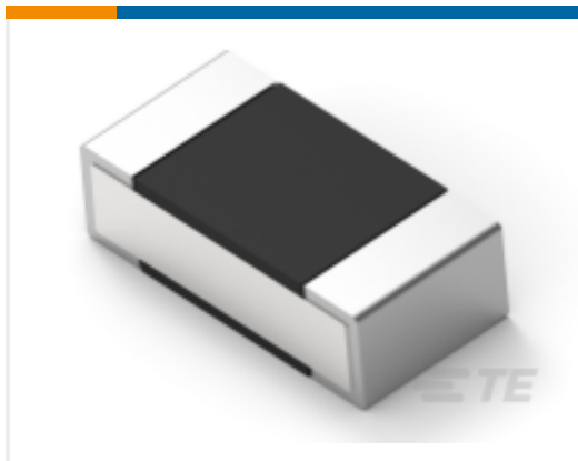
TE Part #2176308-6 RP 1E 0.1W 150K 0.1% 25PPM 5K RL