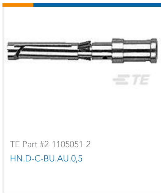
TE Part #2-1105051-2 HN.D-C-BU.AU.0,5