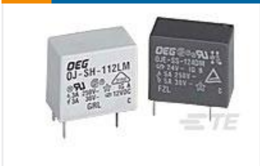
TE Part #1721538-7 OJ-SS-124HM2,000