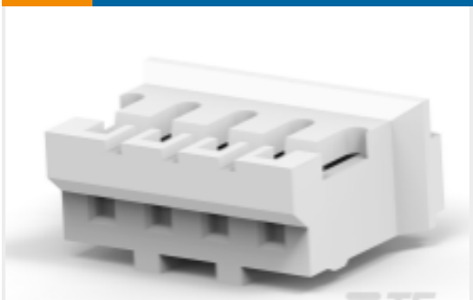
TE Part #440129-6 AMP HPI 2.0 mm Receptacle Housings