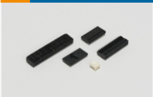
Wire-to-Board Connector Assemblies & Housings(139)