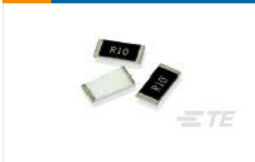
TE Part #4-2176057-3 RLP73K 3A R56 1% 1K RL