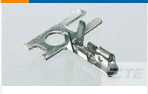
TE Part #1735801-1 2.0mm,Crimp,Contact