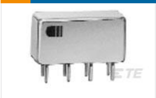
TE Part #1-1617036-2 HFW4A1201K00 = 2100 HFW 4A REL