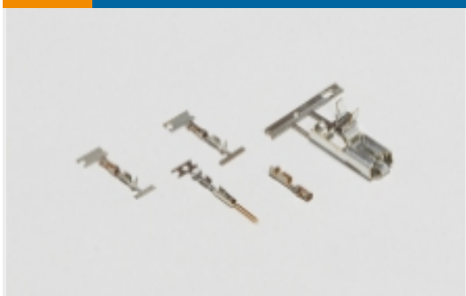
Wire-to-Board Connector Contacts(2)