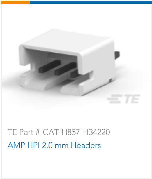
TE Part # CAT-H857-H34220 AMP HPI 2.0 mm Headers