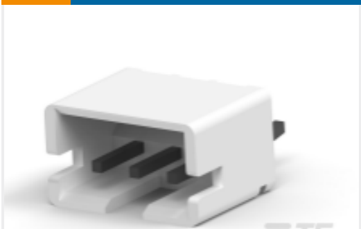
TE Part #440054-3 AMP HPI 2.0 mm Headers