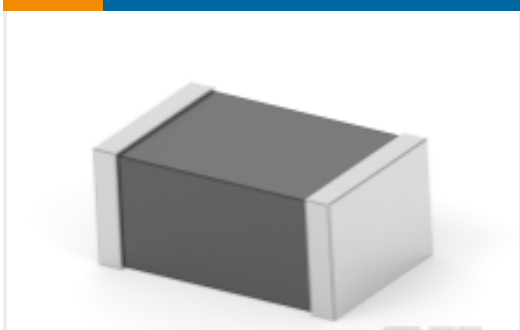
TE Part #1-2176486-6 BMC 0805 470R 25% A Gen C