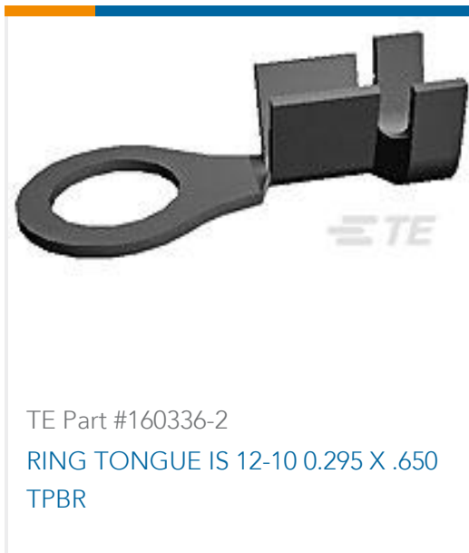
TE Part #160336-2 RING TONGUE IS 12-10 0.295 X .650 TPBR