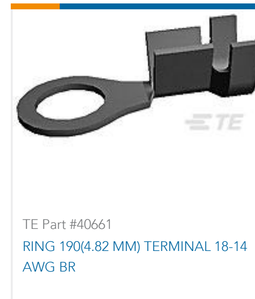
TE Part #40661 RING 190(4.82 MM) TERMINAL 18-14 AWG BR