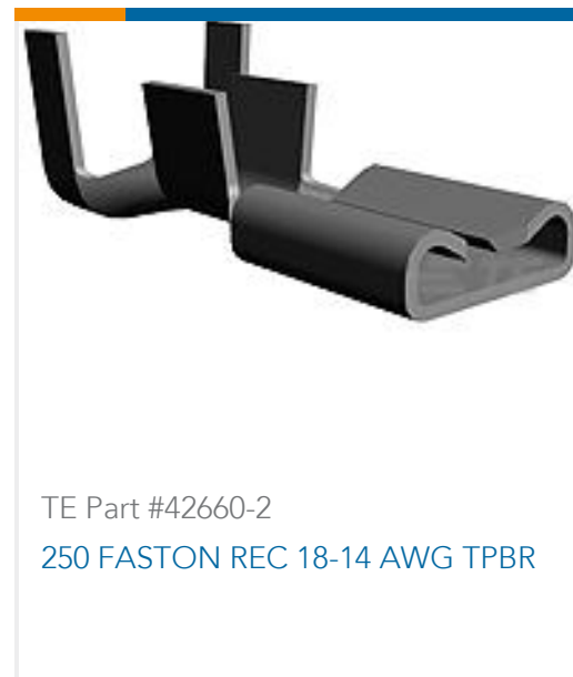
TE Part #42660-2 250 FASTON REC 18-14 AWG TPBR