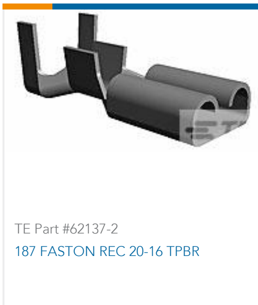
TE Part #62137-2 187 FASTON REC 20-16 TPBR