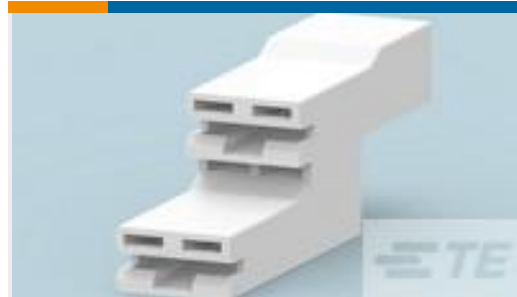
TE Part #521955-1 PL MKIII 250 REC HSG 2P NYLON NAT