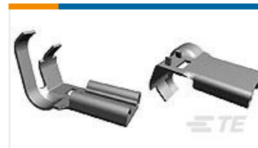
TE Part #1742543-1 250 FASTON, FLAG, REC., 18-12 AWG, NPST