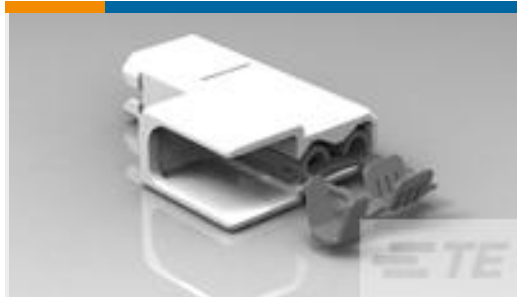
TE Part #521596-2 ULTRA-POD 187 ASSY REC 22-18 AWG TPBR