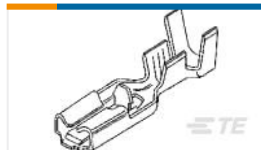
TE Part #63195-1 PL 187 RECEPTACLE 20-16 AWG TPBR