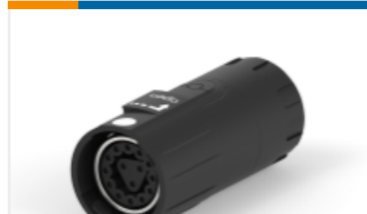
TE Part #ESB205N00320003000 915 PLUG