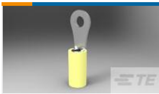
TE Part #2-323914-1 TERMINAL,PIDG R 26-22 4