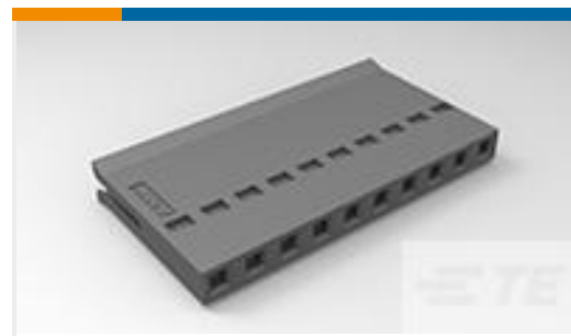
TE Part #487378-2 003 HOUSING FFC RCPT 100CL SR