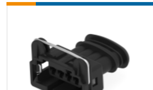
TE Part #2137211-1 4P SPLASH PROOF CONNECTOR, ASS