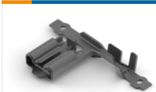
TE Part #2299281-2 POD-LOK 250 FLAG RCPT.AWG 22-18 PTPBR