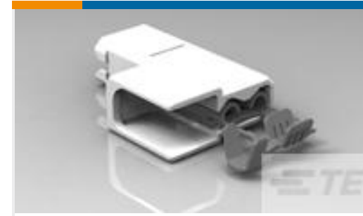
TE Part #521596-2 ULTRA-POD 187 ASSY REC 22-18 AWG TPBR