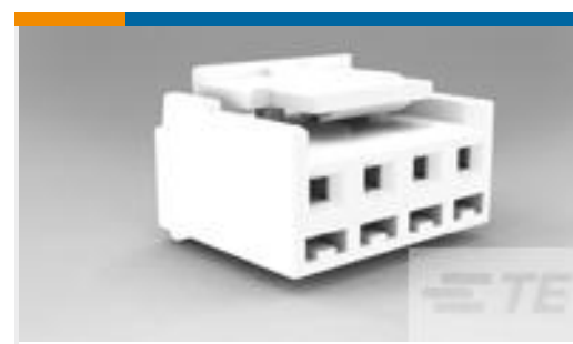
TE Part #2132781-8 08P EP-II HOUSING, NATURAL