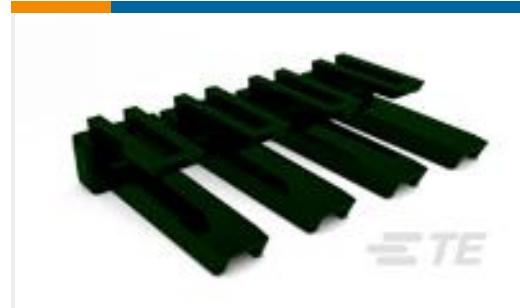
TE Part #1-2132782-2 12 pos. EP II breakaway retain