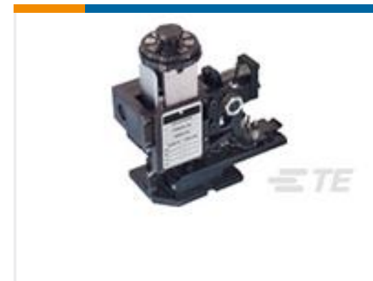
TE Part # 1855654-1 HDM/FA HBEMPO140T1400 LM CUT