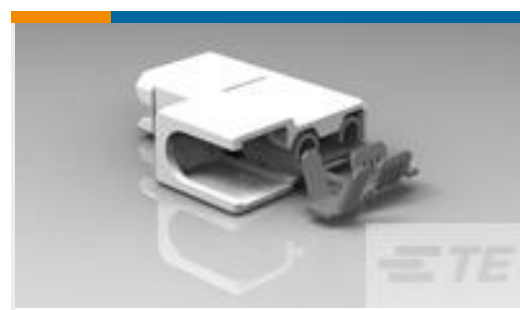
TE Part #521411-2 ULTRA-POD 250 ASY REC 22-18 AWG TPBR