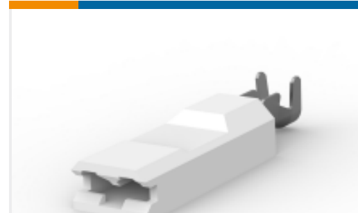
TE Part #521284-2 ULTRA POD: Straight, Receptacle Assembly, Tin Plated, .187 inch