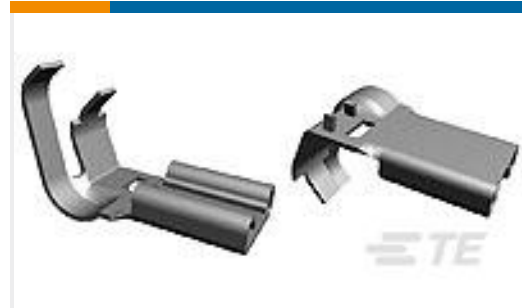
TE Part #41531 250 FASTON FLAG REC 18-12 AWG BR