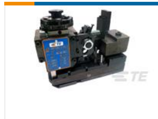
TE Part # 1-687392-9 HB 9EAPR140T1400 G