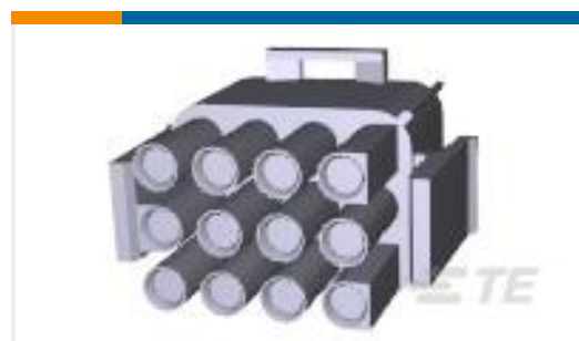
TE Part #794742-1 12P UMNL PLUG HSG NATL