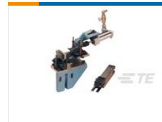
TE Part # 565501-1 STD HBEMPR140T1400K