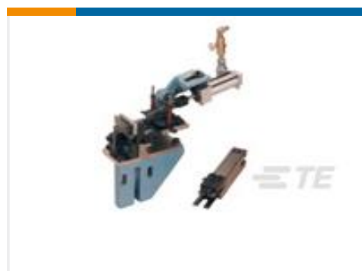
TE Part # 565501-1 STD HBEMPR140T140OK