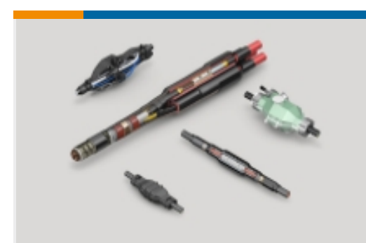
Joints & Splices(1)