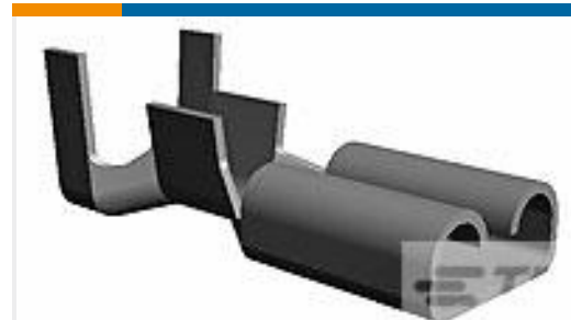
TE Part #170037-2 187 FASTON,REC.,20-16 AWG,TPBR