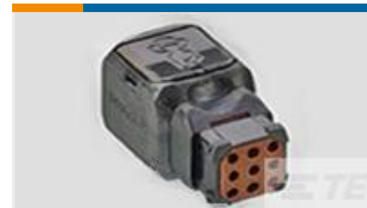
TE Part #D369-P99-CP0 369 9 WAY PLUG, NO CONTACTS, PIN