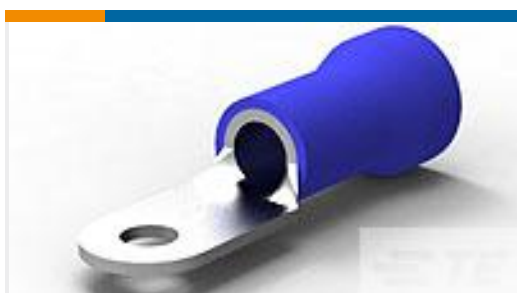
TE Part #52265 TERMINAL R PG 6 10