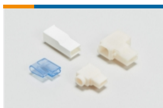
Crimp Terminal Housings(42)