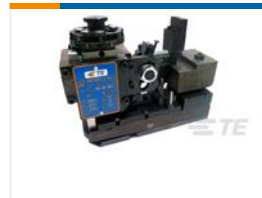
TE Part # 1-687392-9 HB 9EAPR140T140O G