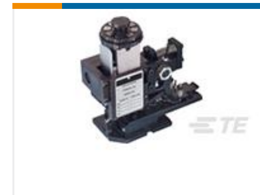
TE Part # 1855654-1 HDM/FA HBEMPO140T140O LM CUT