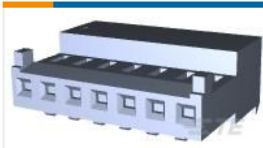
TE Part #3-643813-7 07P MTA100 CONN ASSY POL RIB