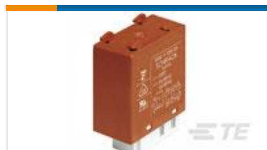
TE Part #3-1415419-5 0419 11 0301 00