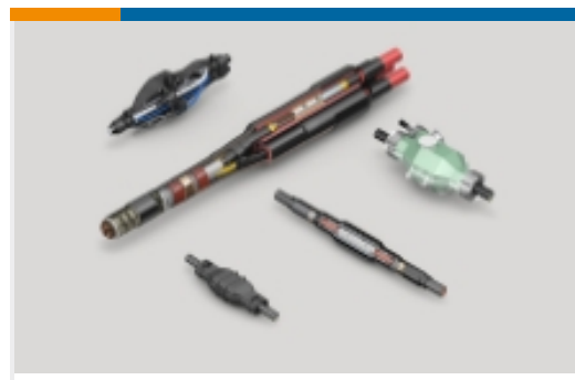
Joints & Splices(1)