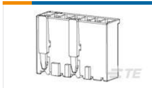
TE Part #928247-3 3P ST-TIMER GEH