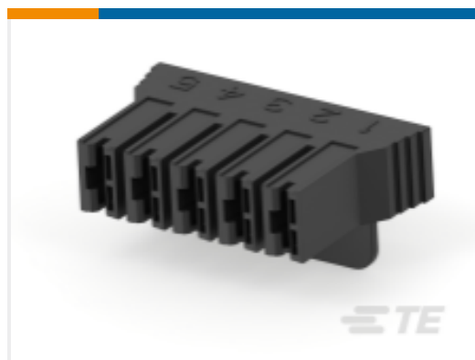
TE Part #1969897-1 250 FASTON HSG.,REC.,5 POS,BLACK