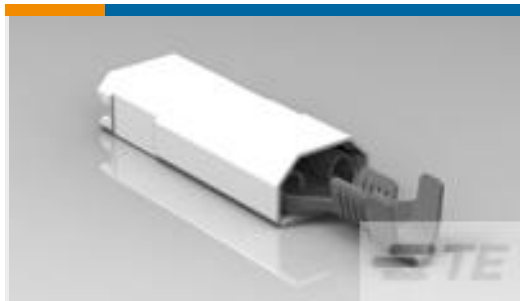
TE Part #521367-2 ULTRA-POD 250 ASSY REC 18-14 AWG TPBR