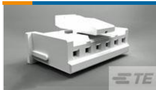
TE Part #1-1969442-1 EP 2.5 TPA Housing, 11 Pos