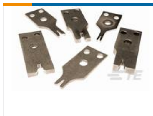
TE Part #852743-3 CRIMPER, WIRE