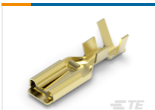
TE Part #2331225-1 187 PL EX REC. 20-14AWG PTBR