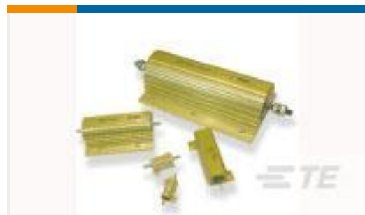
TE Part #7-1625999-5 HSC100 8R0 5%