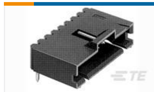
TE Part #5-103635-1 02 MTE HDR SRRA LTCH.100CL LF