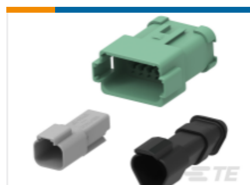
TE Part #DT04-3P-L012 DEUTSCH DT Receptacle Connectors