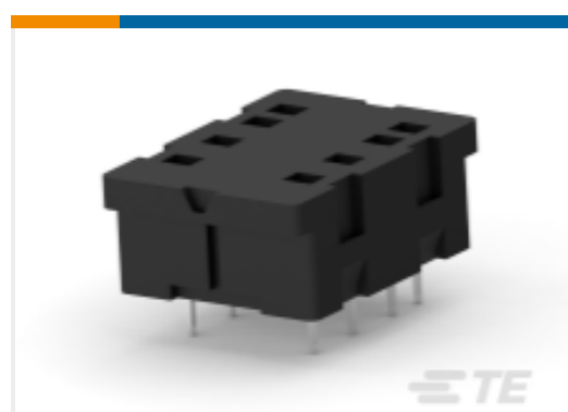
TE Part #5-1415043-1 PT78602