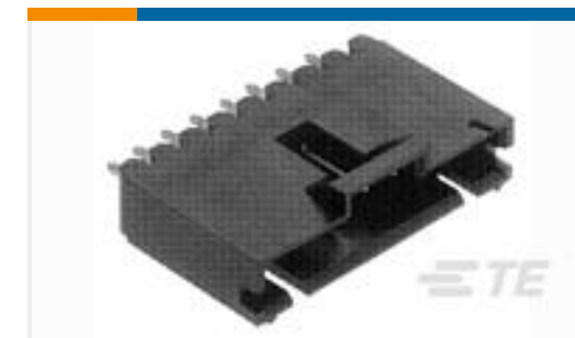
TE Part #103638-2 03 MTE HDR SRST LATCH .100CL