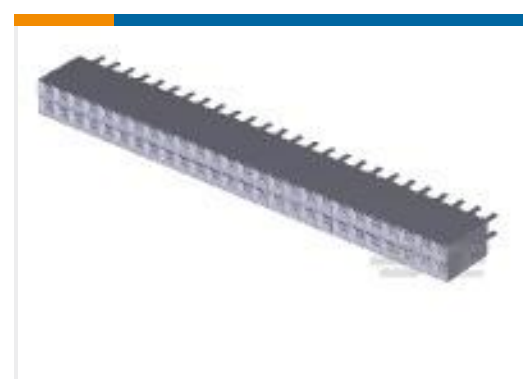
TE Part #7-534998-6 52 MODIV VRT DR CE 100/125