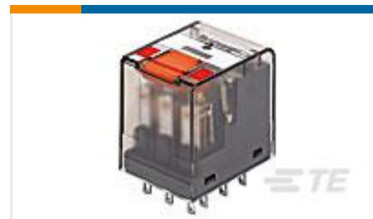
TE Part #4-1419111-1 PT270012