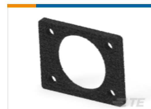
TE Part #DT3P-L012-GKT GASKET, 3P, BLK, DT/DTM