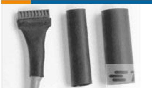
TE Part #CA0768-000 DWP-125-1-2-2IN