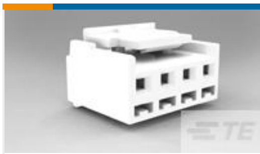
TE Part #2132781-7 07P EP-II HOUSING, NATURAL