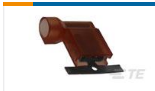
TE Part #2-520128-2 ULTRA-FAST 250 ASY REC 22-18 AWG TPBR