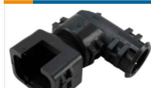
TE Part #2302494-1 SOC CONN CVRASSY,2POS, AMPSEAL16,90DEG,MC