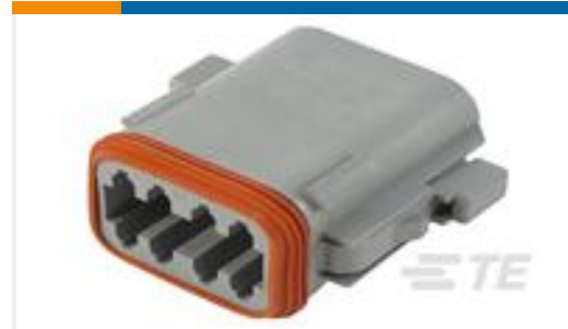
TE Part #DT06-08SA-P012 PLG, 8P, GRY, N, SEAL RET, A