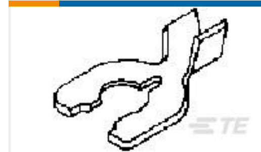
TE Part #485073-1 SPADE TERMINAL 20-16 AWG TPBR