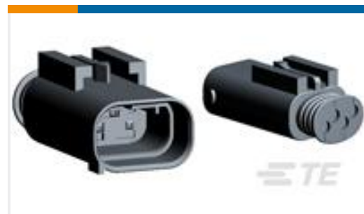
TE Part #1-967584-3 4POS MQS TAB SEALED COD A