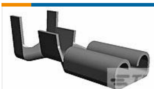
TE Part #60621-1 187 FASTON REC 20-16 aWG NPST