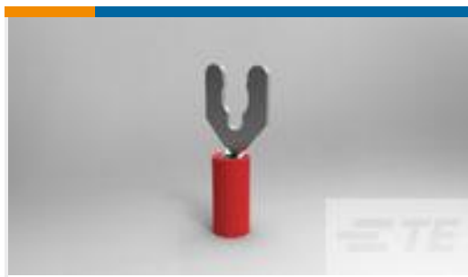
TE Part #52930 PIDG SP SPD 22-16COMM22-18MIL8