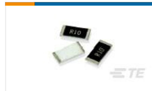
TE Part #6-1622824-1 RL73N 1J R10 5% 5K RL