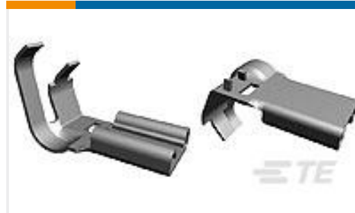
TE Part #63577-1 250 FASTON FLAG REC 22-16 AWG BR