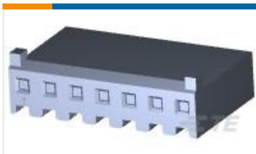
TE Part #770849-7 07P SL156 HSG W/LCK RMP & TABS