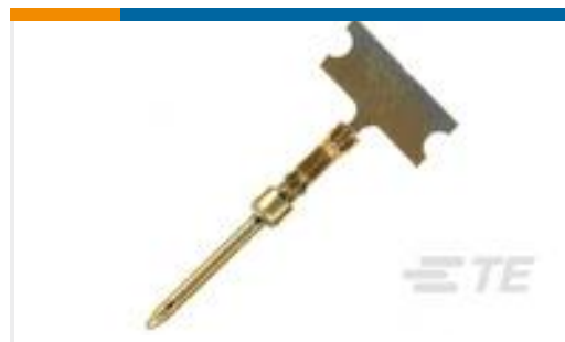
TE Part #66507-9 PIN CONTACT, 20 DF