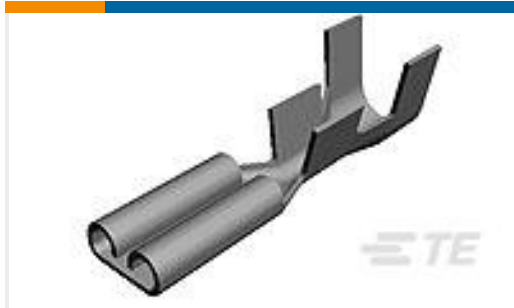
TE Part #41771 250 FASTON REC 22-18 AWG BR