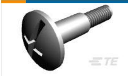
TE Part #208211-1 SCREW SHOULDER, SPEC