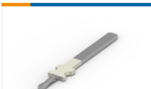
TE Part #1394353-2 FLACHSTE A-P 1,5