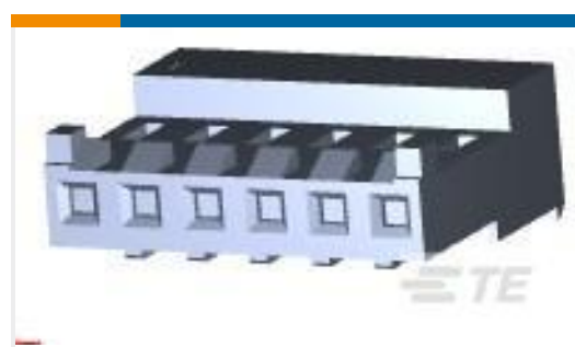
TE Part #3-643818-6 06P MTA156 CONN ASSY 20AWG YEL