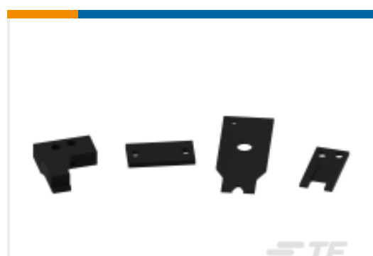
TE Part #653595-1 SHEAR BLADE