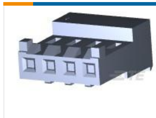
TE Part #3-643818-4 04P MTA156 CONN ASSY 20AWG YEL