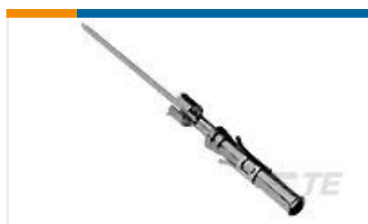
TE Part #5-66461-9 SKT,.062 DIA,.025 SQ POST,LP