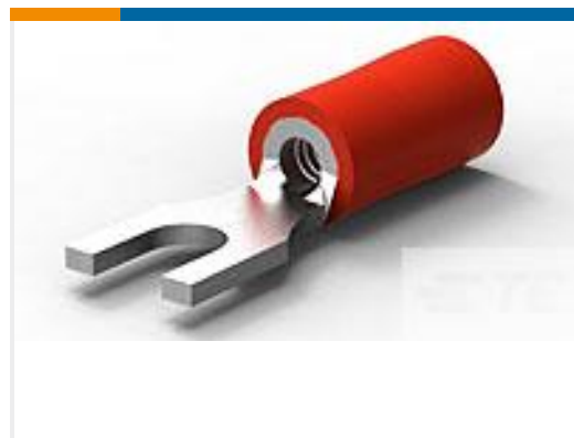
TE Part #165004 PLASTI-GRIP, SPADE 22-16 4