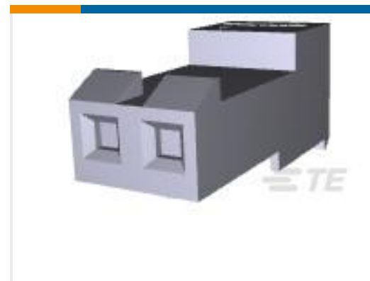
TE Part #3-640429-2 02P MTA156 CONN ASSY 24AWG WHT