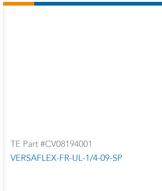
TE Part #CV08194001 VERSAFLEX-FR-UL-1/4-09-SP