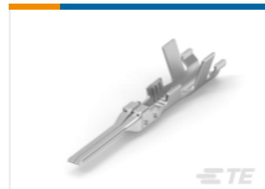
TE Part #2329906-1 Power Versa-Lock TAB, 18-20, 2X22 AWG