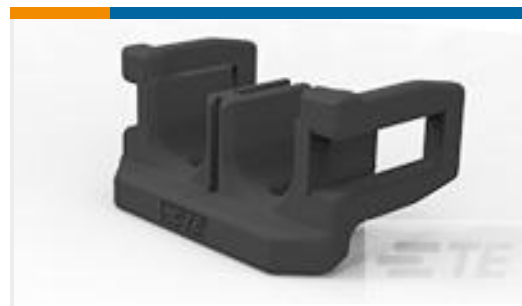
TE Part #2-1971777-2 PTL TPA HWI 1 X 2 NATURAL