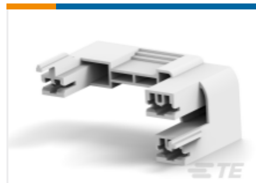
TE Part #1969870-1 3P, 250 AND 187 SRS, POSI-LOCK MARK II