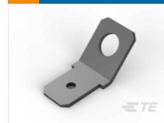
TE Part # 181949-2 250 FASTON,TAB,TPBR