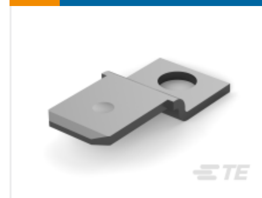
TE Part # 42506-2 250 FASTON TAB TPBR