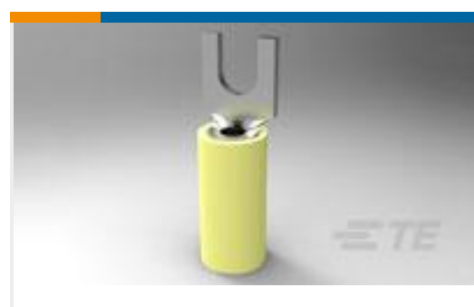
TE Part #321035 PIDG 26-22 SPADE #4 STUD