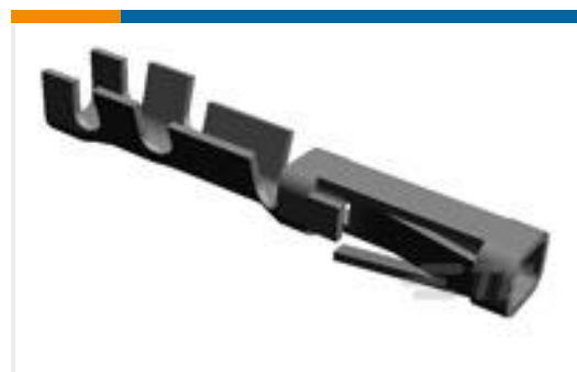
TE Part #181271-2 MOD 2 CONTACT REC.