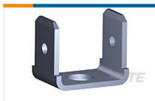
TE Part #41619 250 FASTON TAB BR