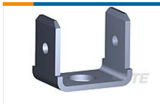
TE Part #42802-1 250 FASTON TAB TPBR