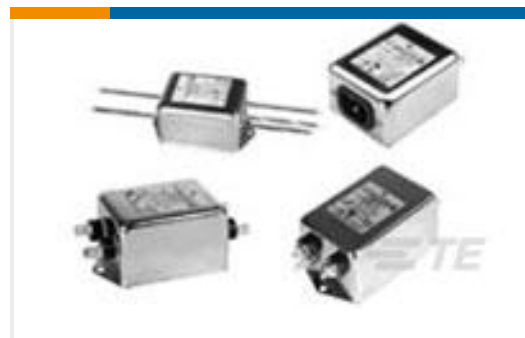
TE Part #6609032-9 5VR1=F7202 S0