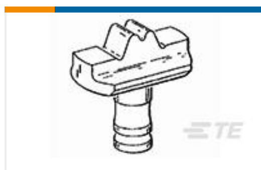
TE Part #48131 HYP8 SOLIS 1/0-4/0AWG INDENTER