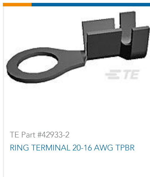
TE Part #42933-2 RING TERMINAL 20-16 AWG TPBR