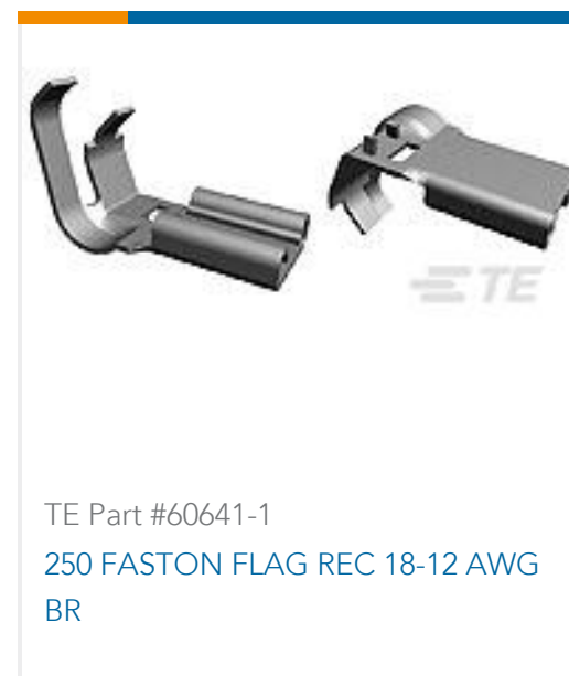
TE Part #60641-1 250 FASTON FLAG REC 18-12 AWG BR