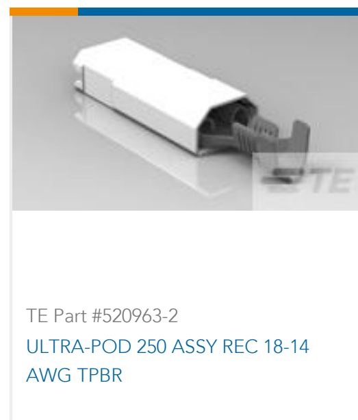
TE Part #520963-2 ULTRA-POD 250 ASSY REC 18-14 AWG TPBR