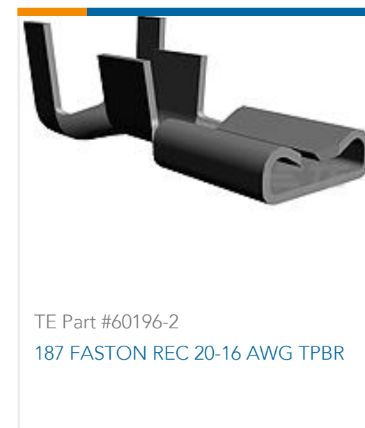
TE Part #60196-2 187 FASTON REC 20-16 AWG TPBR