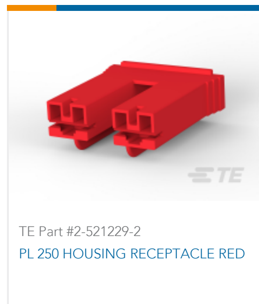
TE Part #2-521229-2 PL 250 HOUSING RECEPTACLE RED