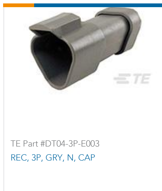
TE Part #DT04-3P-E003 REC, 3P, GRY, N, CAP