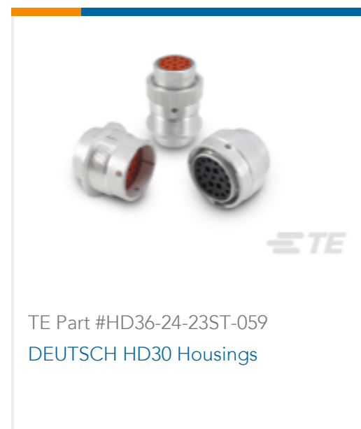
TE Part #HD36-24-23ST-059 DEUTSCH HD30 Housings