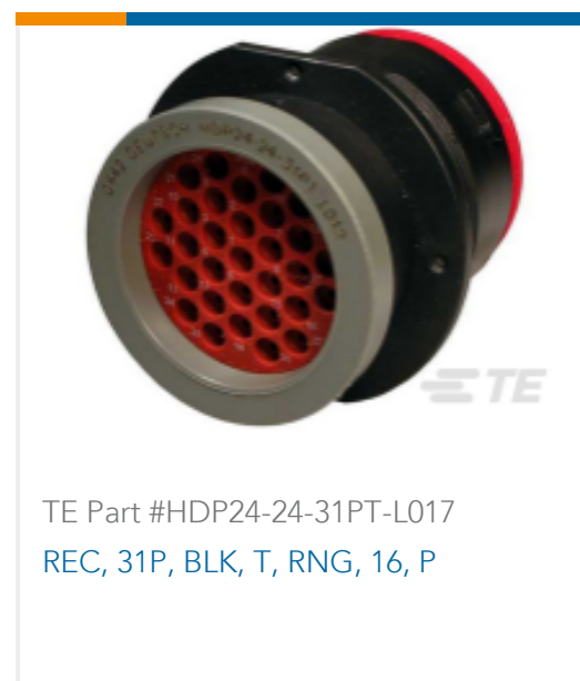
TE Part #HDP24-24-31PT-L017 REC, 31P, BLK, T, RNG, 16, P