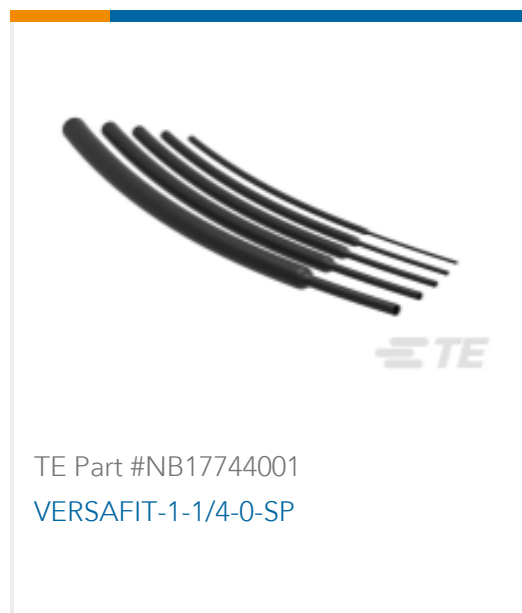
TE Part #NB17744001 VERSAFIT-1-1/4-0-SP