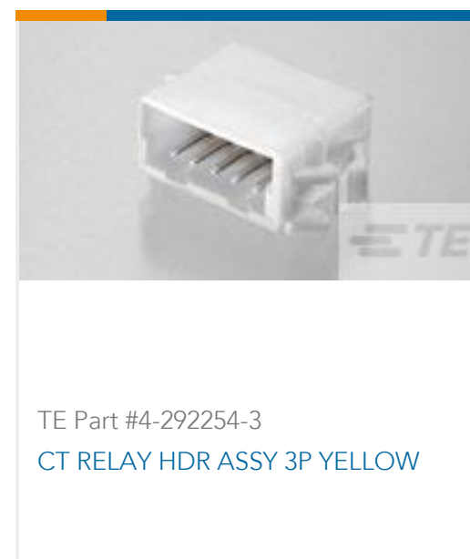
TE Part #4-292254-3 CT RELAY HDR ASSY 3P YELLOW