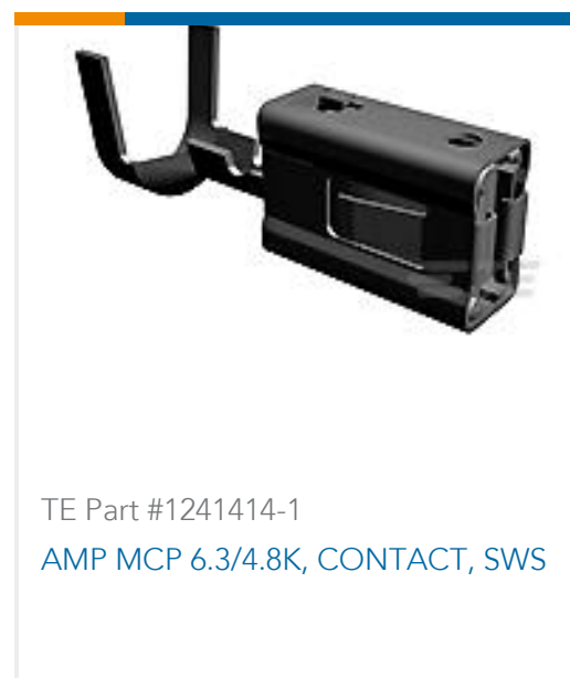
TE Part #1241414-1 AMP MCP 6.3/4.8K, CONTACT, SWS