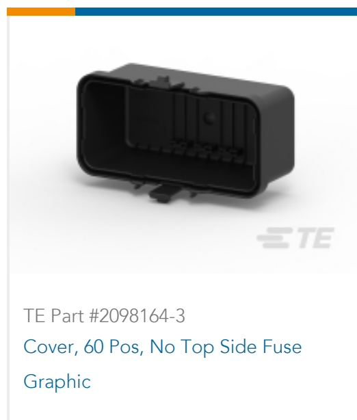
TE Part #2098164-3 Cover, 60 Pos, No Top Side Fuse Graphic