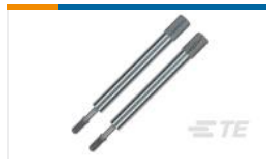
TE Part #747784-3 AMPLI JACKSCREW 4-40 KIT