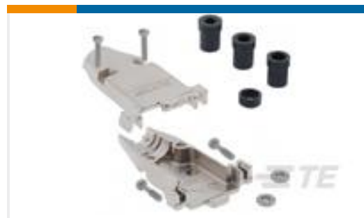
TE Part #5748676-1 DIE CAST CBL CLMP KIT, SZ 1