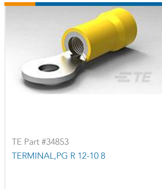
TE Part #34853 TERMINAL, PG R 12-10 8