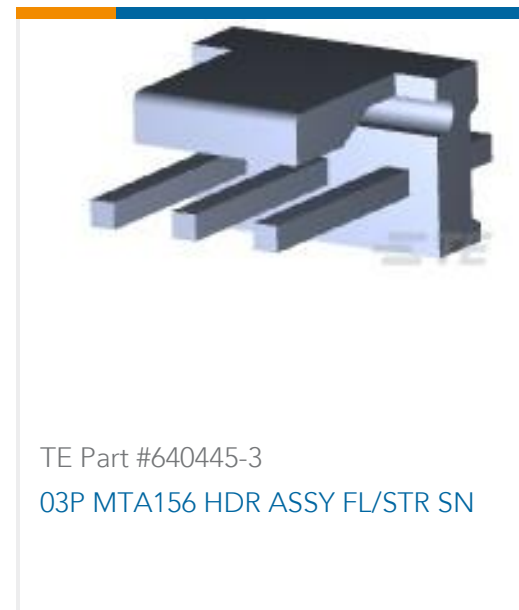
TE Part #640445-3 03P MTA156 HDR ASSY FL/STR SN