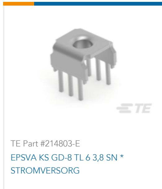
TE Part #214803-E EPSVA KS GD-8 TL 6 3,8 SN * STROMVERSORG