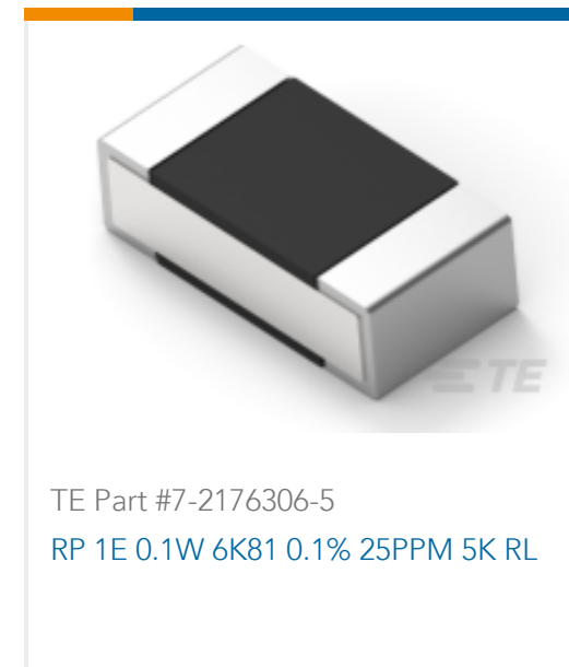
TE Part #7-2176306-5 RP 1E 0.1W 6K81 0.1% 25PPM 5K RL