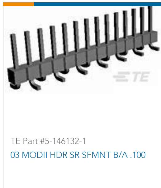
TE Part #5-146132-1 03 MODII HDR SR SFMNT B/A .100