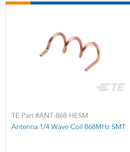
TE Part #ANT-868-HESM Antenna 1/4 Wave Coil 868MHz SMT