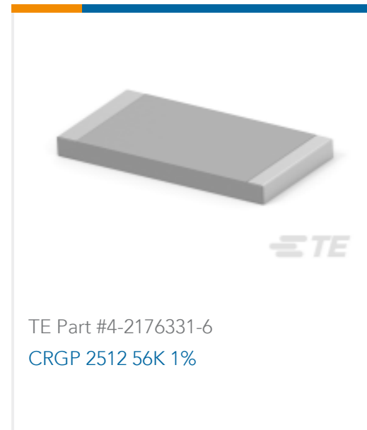
TE Part #4-2176331-6 CRGP 2512 56K 1%