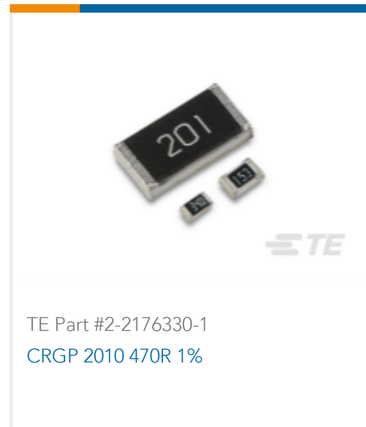
TE Part #2-2176330-1 CRGP 2010 470R 1%