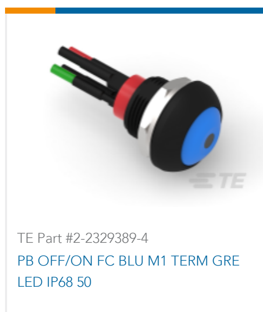
TE Part #2-2329389-4 PB OFF/ON FC BLU M1 TERM GRE LED IP68 50