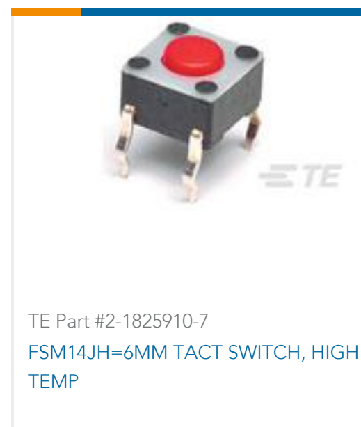
TE Part #2-1825910-7 FSM14JH=6MM TACT SWITCH, HIGH TEMP