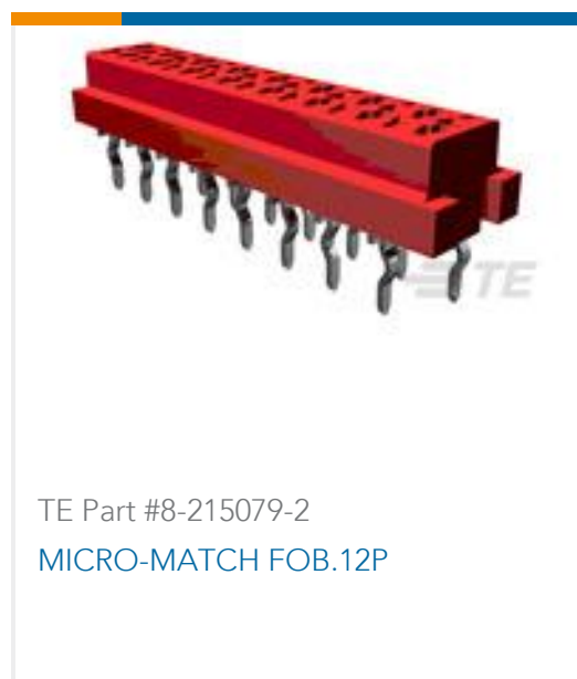
TE Part #8-215079-2 MICRO-MATCH FOB.12P