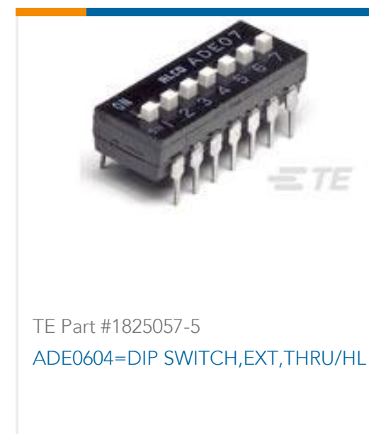
TE Part #1825057-5 ADE0604=DIP SWITCH,EXT,THRU/HL TEMP