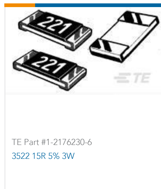
TE Part #1-2176230-6 3522 15R 5% 3W