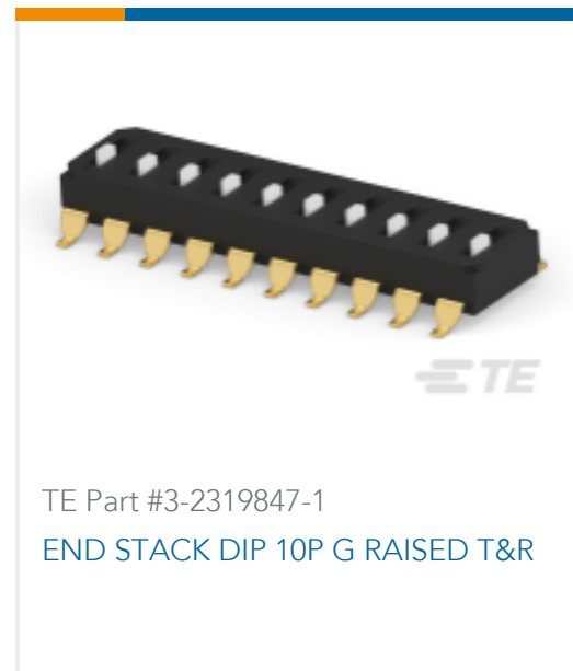
TE Part #3-2319847-1 END STACK DIP 10P G RAISED T&R