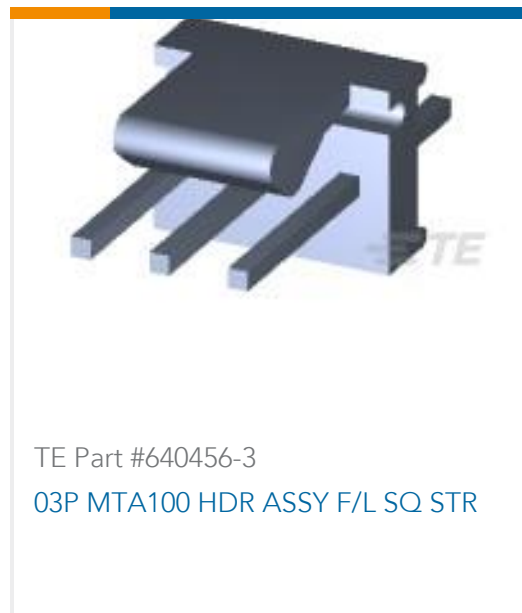
TE Part #640456-3 03P MTA100 HDR ASSY F/L SQ STR