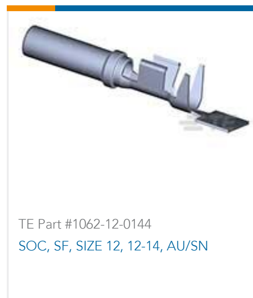
TE Part #1062-12-0144 SOC, SF, SIZE 12, 12-14, AU/SN