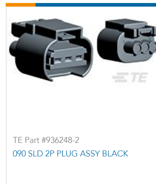
TE Part #936248-2 090 SLD 2P PLUG ASSY BLACK