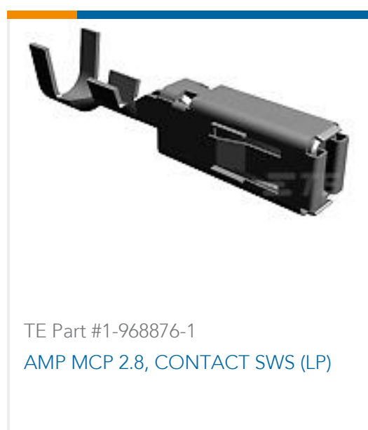
TE Part #1-968876-1 AMP MCP 2.8, CONTACT SWS (LP)