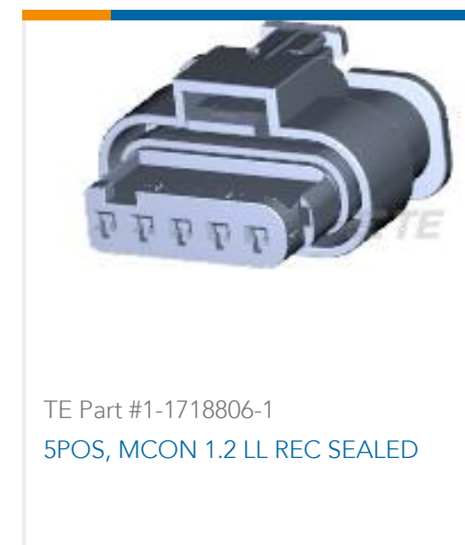
TE Part #1-1718806-1 5POS, MCON 1.2 LL REC SEALED