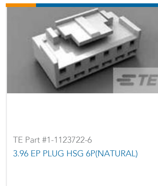
TE Part #1-1123722-6 3.96 EP PLUG HSG 6P(NATURAL)