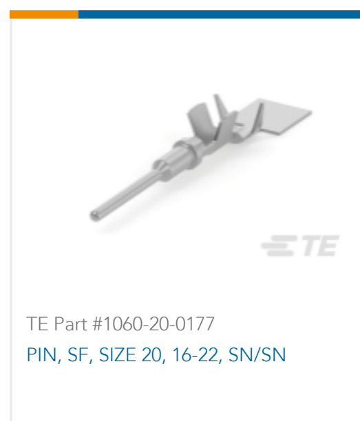
TE Part #1060-20-0177 PIN, SF, SIZE 20, 16-22, SN/SN