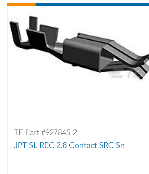
TE Part #927845-2 JPT SL REC 2.8 Contact SRC Sn