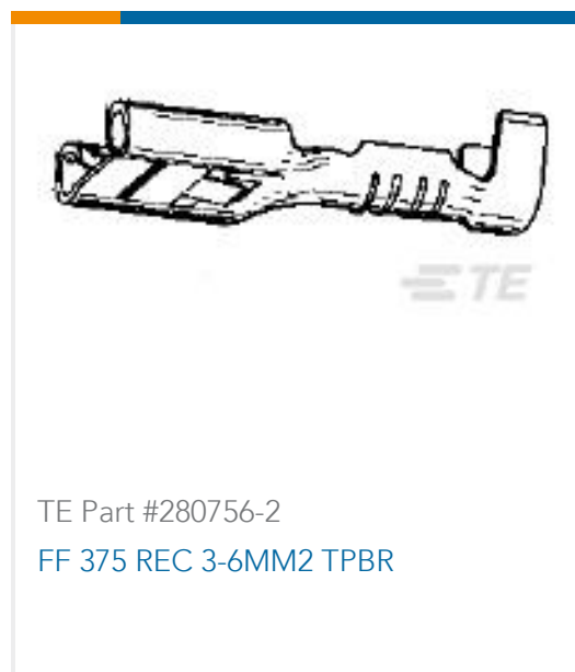
TE Part #280756-2 FF 375 REC 3-6MM2 TPBR