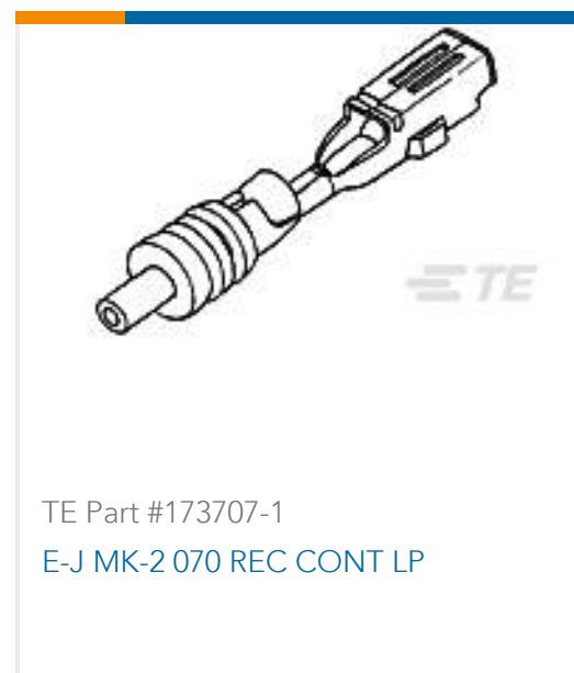
TE Part #173707-1 E-J MK-2 070 REC CONT LP