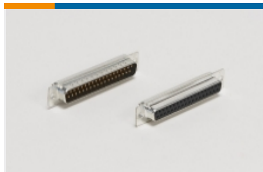
Solder D-Sub Connectors(7)