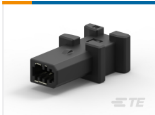
TE Part #1971153-1 CONN ASSY INDUSTRIAL MINI I/O