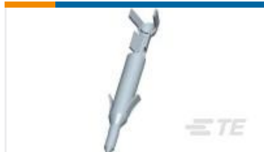
TE Part #170359-1 UNIV M-N-L PIN 26-22 AWG