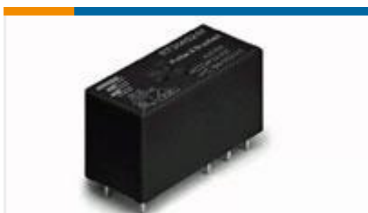
TE Part #4-1419108-2 RTE44012F