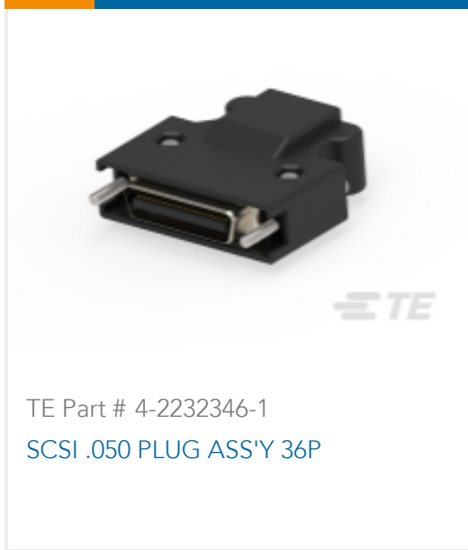
TE Part # 4-2232346-1 SCSI .050 PLUG ASS'Y 36P