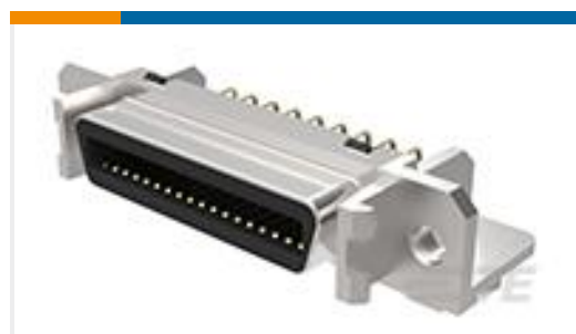
TE Part #5-2232516-1 SCSI .050 REC ASS'Y 50P PB-FREE