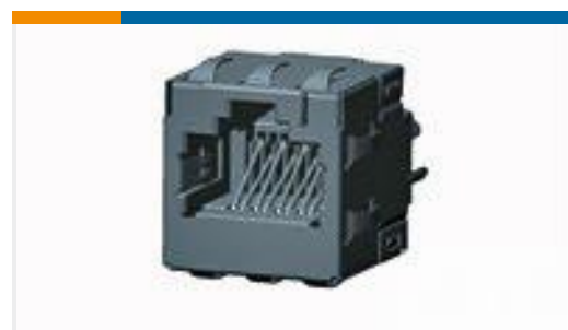
TE Part #2232261-1 1394_A RECEPTACLE UP RIGHT RA THRU HOLE