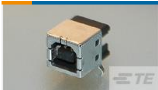
TE Part #292304-1 STD USB TYPE B, R/A, T/H