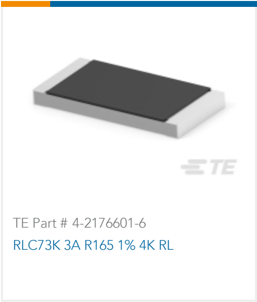
TE Part # 4-2176601-6 RLC73K 3A R165 1% 4K RL