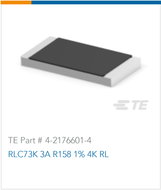
TE Part # 4-2176601-4 RLC73K 3A R158 1% 4K RL