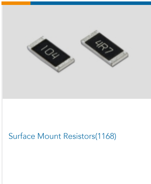
Surface Mount Resistors(1168)