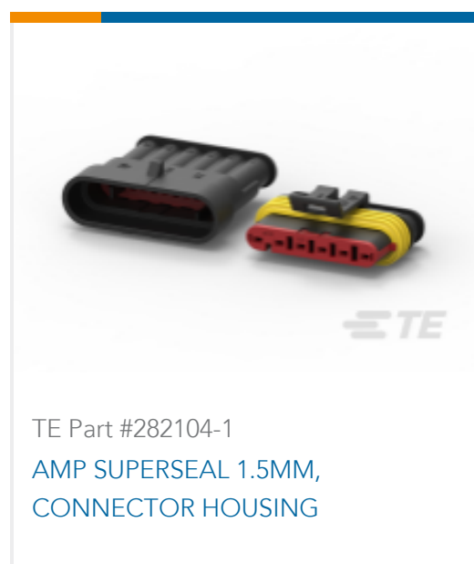
TE Part #282104-1 AMP SUPERSEAL 1.5MM, CONNECTOR HOUSING