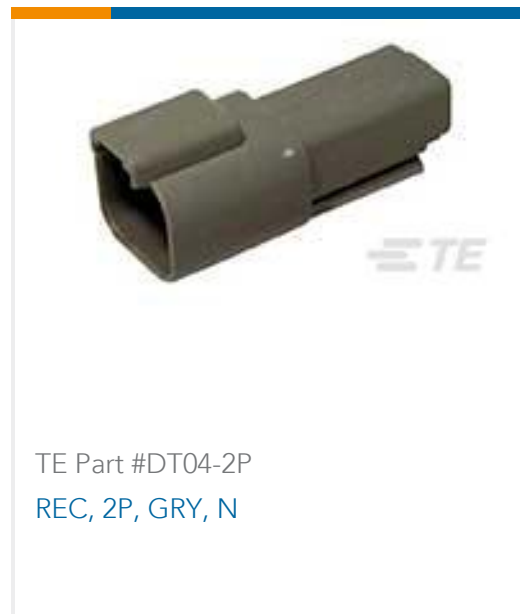
TE Part #DT04-2P REC, 2P, GRY, N