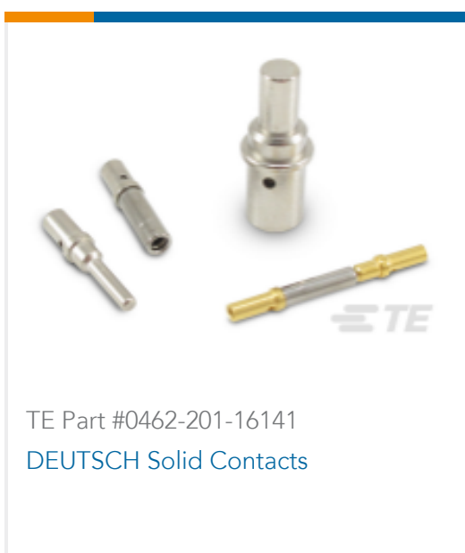
TE Part #0462-201-16141 DEUTSCH Solid Contacts