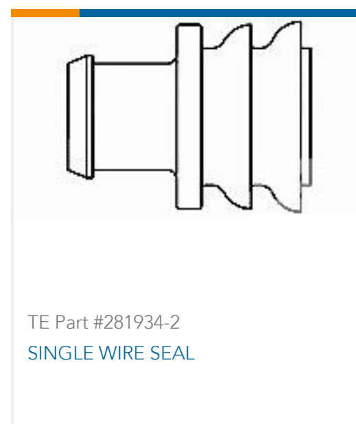
TE Part #281934-2 SINGLE WIRE SEAL