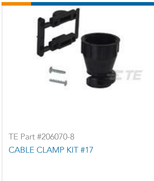
TE Part #206070-8 CABLE CLAMP KIT #17