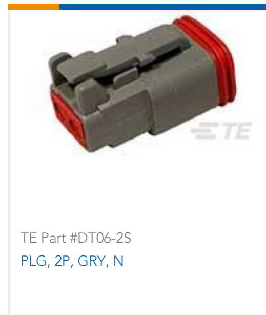
TE Part #DT06-2S PLG, 2P, GRY, N