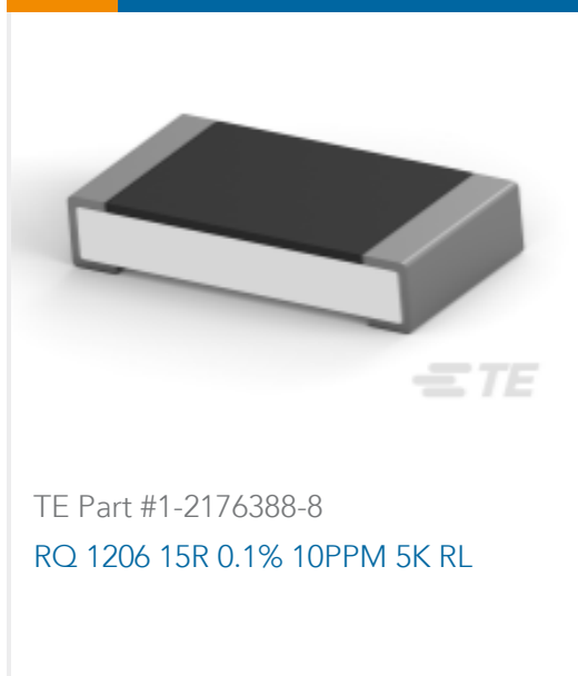
TE Part #1-2176388-8 RQ 1206 15R 0.1% 10PPM 5K RL