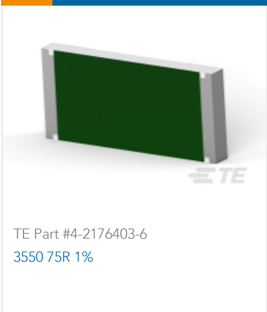
TE Part #4-2176403-6 3550 75R 1%