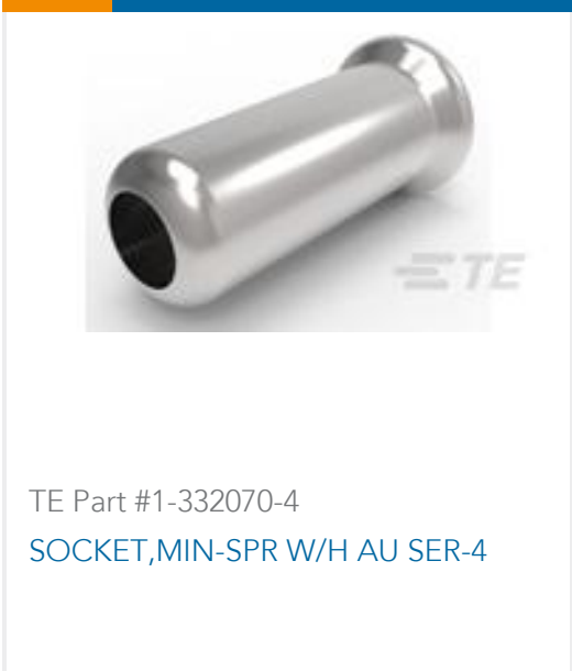
TE Part #1-332070-4 SOCKET,MIN-SPR W/H AU SER-4