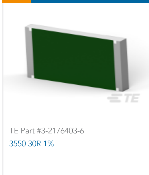
TE Part #3-2176403-6 3550 30R 1%