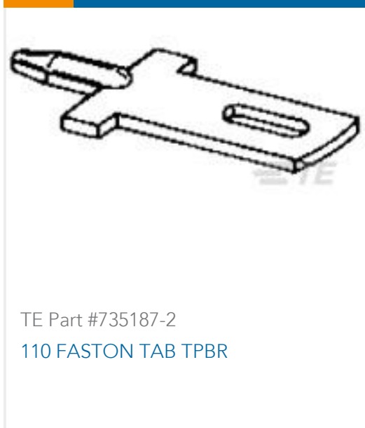
TE Part #735187-2 110 FASTON TAB TPBR