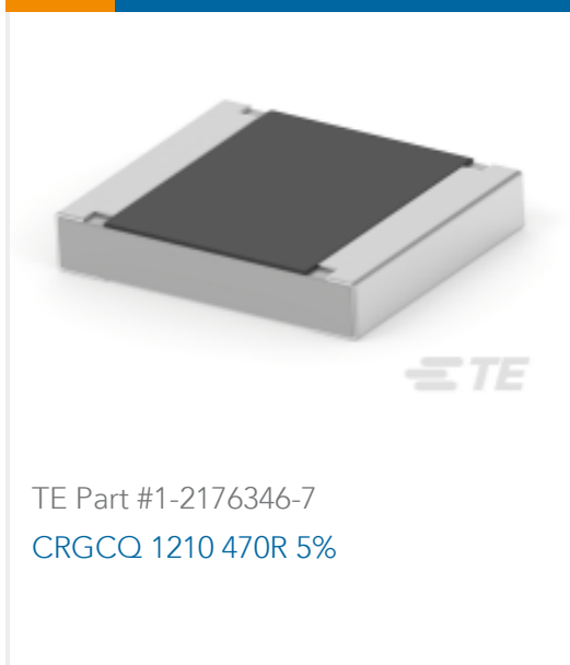
TE Part #1-2176346-7 CRGCQ 1210 470R 5%