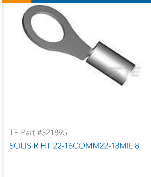
TE Part #321895 SOLIS R HT 22-16COMM22-18MIL 8