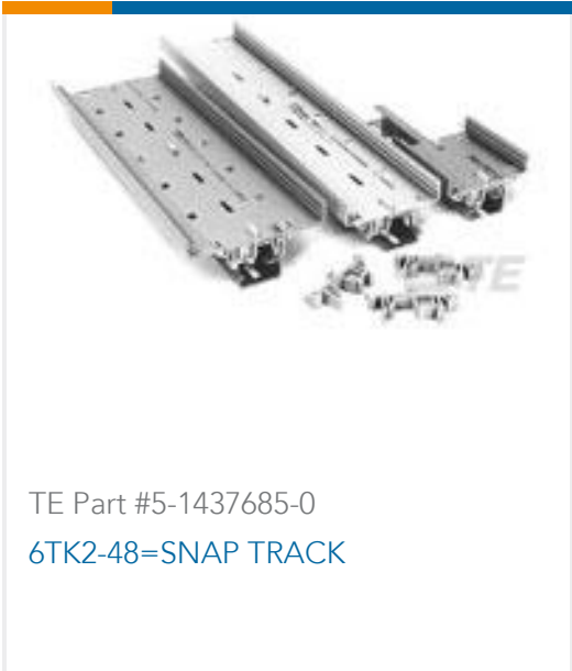
TE Part #5-1437685-0 6TK2-48=SNAP TRACK