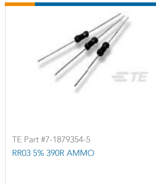
TE Part #7-1879354-5 RR03 5% 390R AMMO