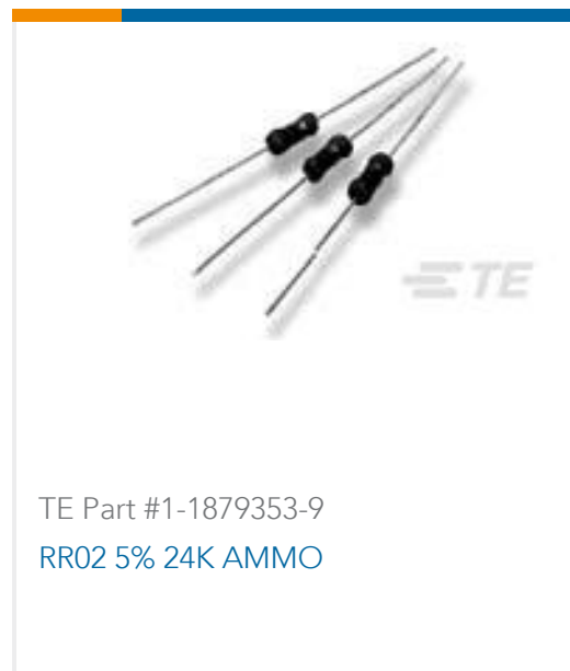
TE Part #1-1879353-9 RR02 5% 24K AMMO