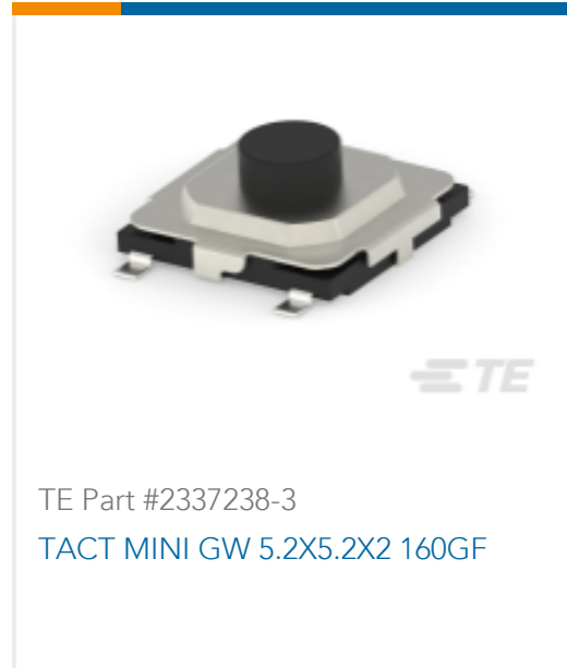
TE Part #2337238-3 TACT MINI GW 5.2X5.2X2 160GF