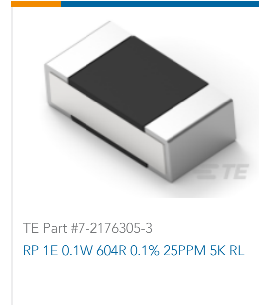
TE Part #7-2176305-3 RP 1E 0.1W 604R 0.1% 25PPM 5K RL