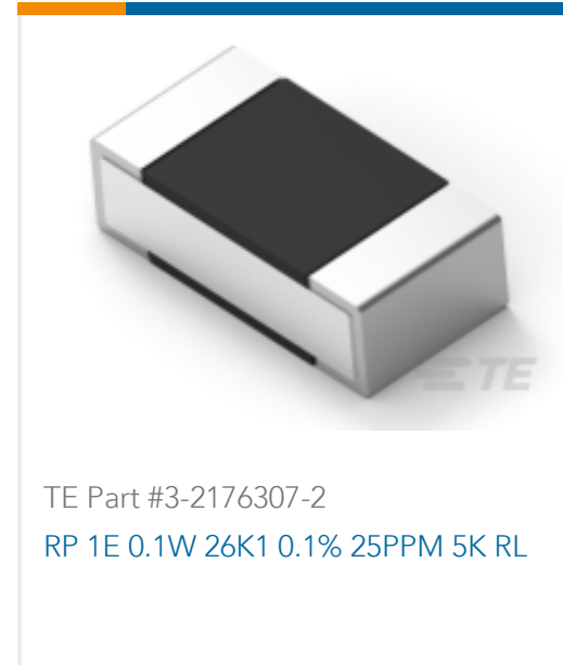
TE Part #3-2176307-2 RP 1E 0.1W 26K1 0.1% 25PPM 5K RL