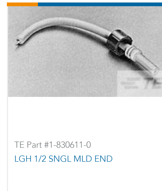
TE Part #1-830611-0 LGH 1/2 SNGL MLD END