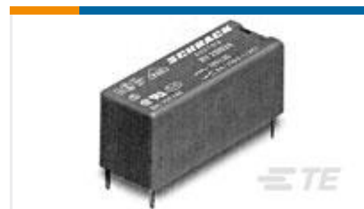
TE Part #4-1393224-9 RY211024