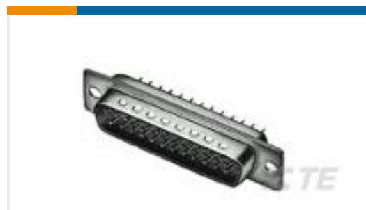
TE Part #7-1393740-8 V42254A2216C209=SUB D STIFTLI