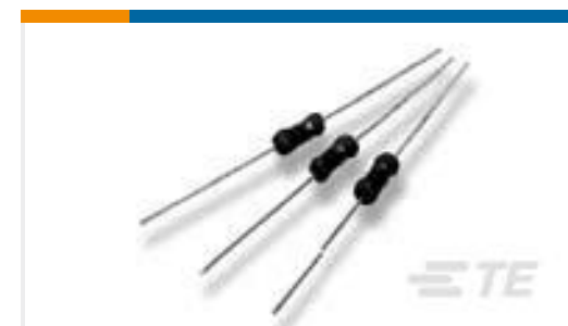
TE Part #1879352-3 RR02 5% R39 AMMO