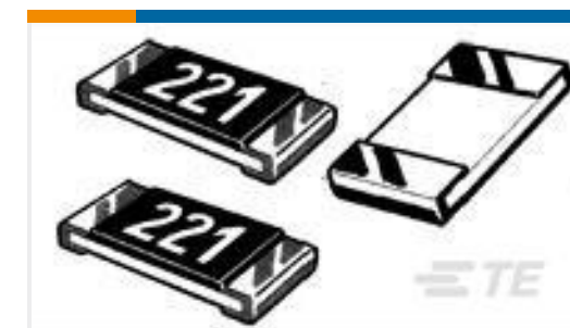
TE Part #2-2176230-6 3522 100R 5% 3W