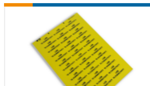
TE Part #3-1768034-3 LEB-3460P-9