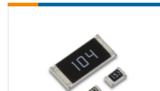
TE Part #3-2176345-4 CRGCQ 1210 5K6 1%