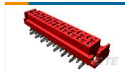
TE Part #7-338069-4 MICRO-MATCH SMD FTE