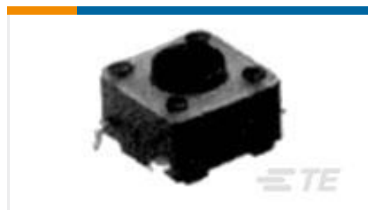
TE Part #4-1437565-2 FSM4JSMATR=TACT SWITCH 6X6MIL