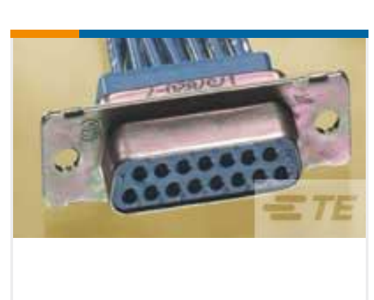
TE Part #207463-1 CRIMP SNAP RCPT ASSY,SZ 3