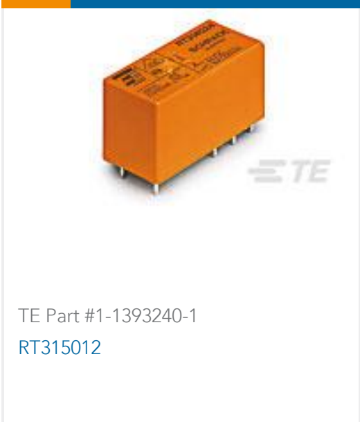
TE Part #1-1393240-1 RT315012