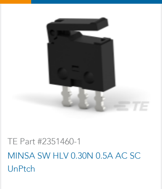
TE Part #2351460-1 MINSA SW HLV 0.30N 0.5A AC SC UnPtch