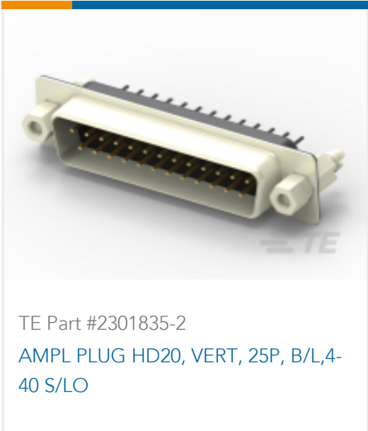
TE Part #2301835-2 AMPL PLUG HD20, VERT, 25P, B/L, 4-40 S/LO