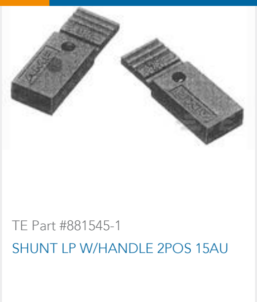
TE Part #881545-1 SHUNT LP W/HANDLE 2POS 15AU