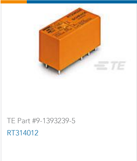
TE Part #9-1393239-5 RT314012