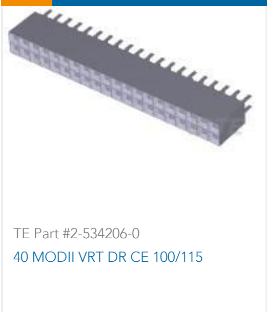
TE Part #2-534206-0 40 MODII VRT DR CE 100/115