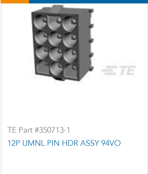
TE Part #350713-1 12P UMNL PIN HDR ASSY 94VO