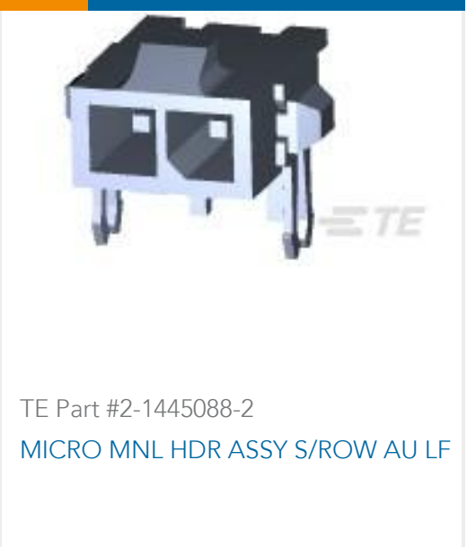
TE Part #2-1445088-2 MICRO MNL HDR ASSY S/ROW AU LF