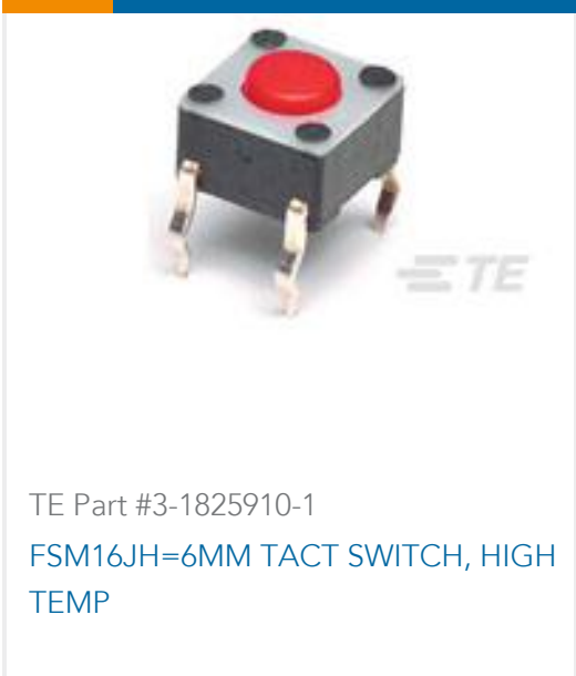
TE Part #3-1825910-1 FSM16JH=6MM TACT SWITCH, HIGH TEMP