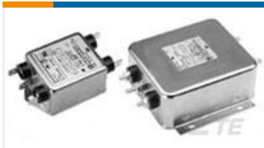
TE Part #6609043-4 20VV1=F7253 S0