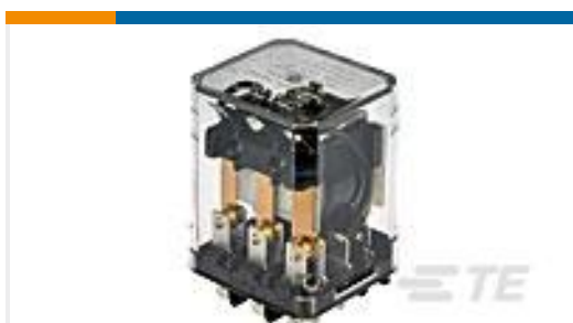
TE Part #4-1393118-2 KUP-17A19-120=KU