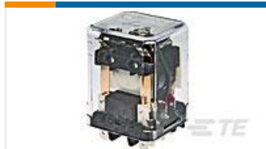
TE Part #1393114-1 KUEP-3D15-24=KU-