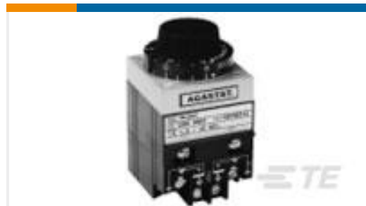
TE Part #2-1423159-3 7012PC=RLY,STD,ON,2P,125VDC,15