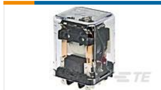
TE Part #8-1393113-6 KUEP-11D15-12=KU