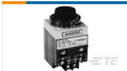
TE Part #2-1423157-0 7012AH=RLY,STD,ON,2P,120VAC,30