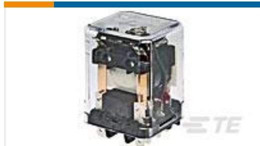
TE Part #8-1393113-7 KUEP-11D15-24=KU-