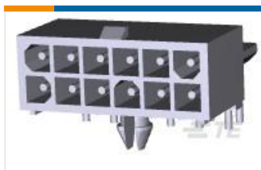
TE Part #1-770972-0 12P MINI UMNL R/A HDR ASSY LF