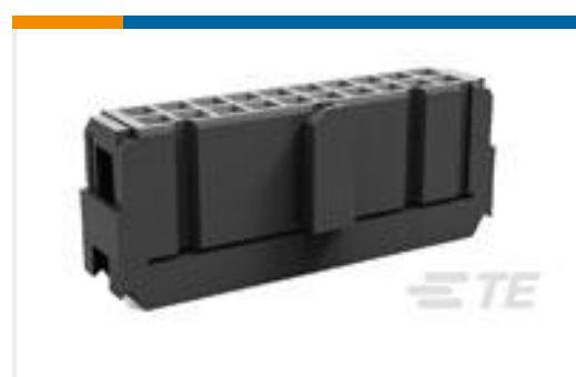
TE Part #1658621-3 16 NOVO MIL/CTR 15DP, LEAD FREE