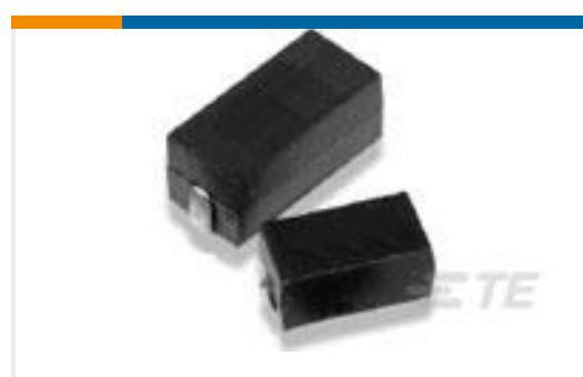
TE Part #2-1879233-5 SMW5 1R0 5%