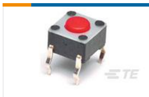
TE Part #3-1825910-1 FSM16JH=6MM TACT SWITCH, HIGH TEMP