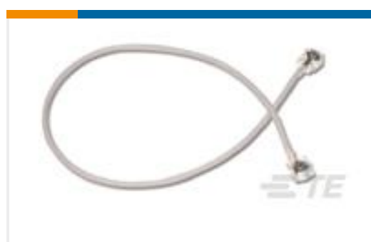
TE Part #2015357-3 C/A, UMCC/UMCC, 1.37 OD CABLE, 100MM LON