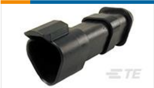
TE Part #DT04-3P-EE01 REC, 3P, BLK, N, XCAP