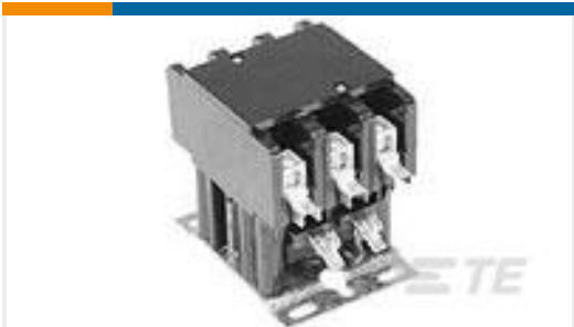
TE Part #4-1611022-9 3100-30J17999CJ=CONTACTOR