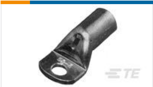
TE Part #709823-3 XCT 240-14