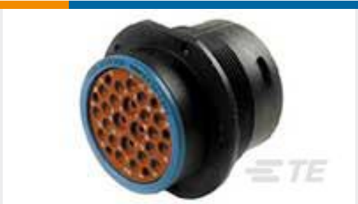
TE Part #HDP24-24-29PE REC, 29P, BLK, E, 12/16/20, P