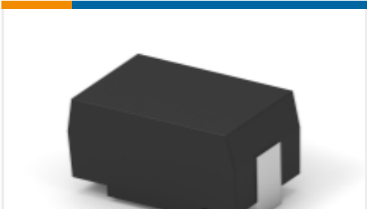
TE Part #4-1879233-9 SMD Power Resistor: 7 Watt, 0.10-500 Ohm