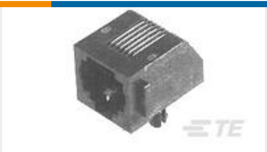
TE Part #5555163-2 MJ,LPF,R/A,6P/4C,PNL STOPS,BU