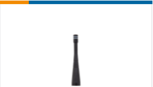
TE Part #ANT-868-CW-QW Antenna 1/4 Wave Whip 868MHz