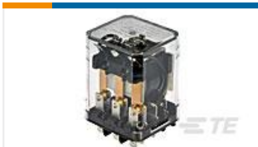
TE Part #8-1393117-7 KUP-14A35-120=KU