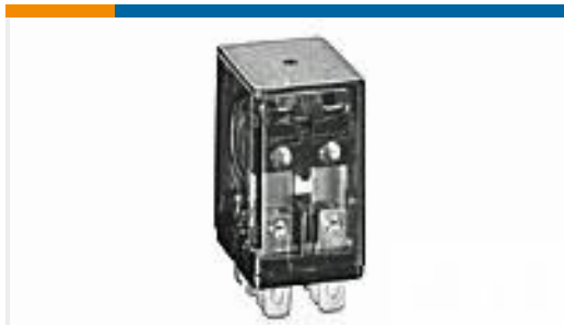
TE Part #3-1393144-3 K10P-11AT5-120=K10/K20