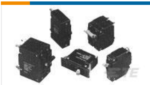
TE Part #6-1393254-4 W92-X1110-30=M6/M7/M9/W6/W7