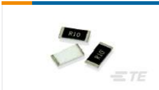
TE Part #4-1622824-5 RL73H 3A R82 1% 4K RL