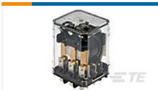
TE Part #6-1393118-0 KUP-5A15-24=KU