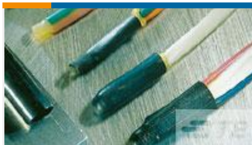
TE Part #EG41086001 ES-CAP-NO.3-B8-0-40MM