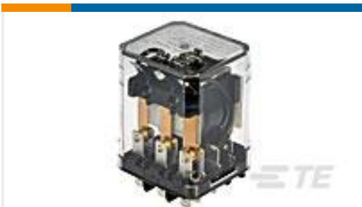
TE Part #5-1393118-9 KUP-5A15-120=KU