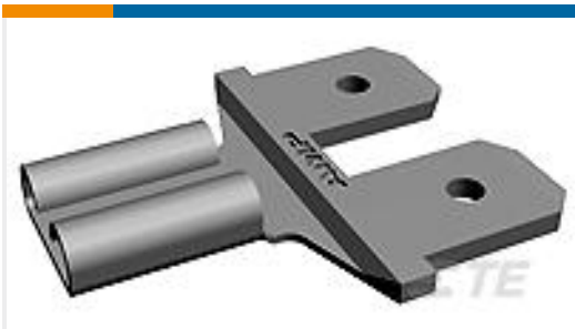
TE Part #63699-1 ADAPTER 187 FASTON TPBR