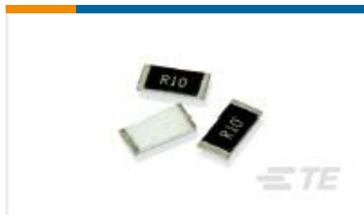
TE Part #1879462-1 RL73H 2B R10 1% 5K RL