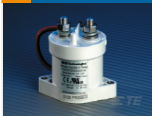
TE Part # 1-1618002-1 EV200ADANA=RELAY, EV200 SPST-NO