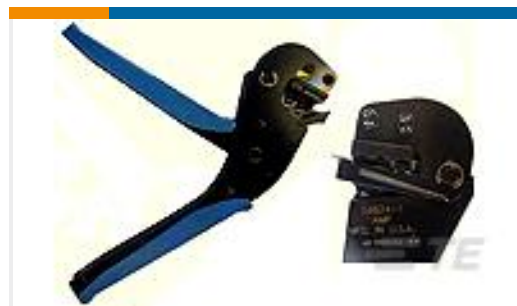
TE Part #59824-1 TETRA-CRIMP PIDG PG FASTON 22-10 ASSY