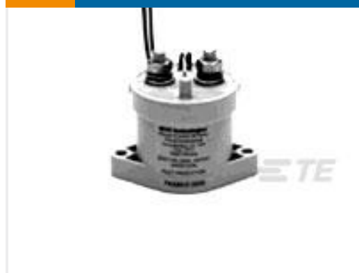
TE Part # 1618002-3 EV200A2ANA=RELAY, EV200 SPST-NO