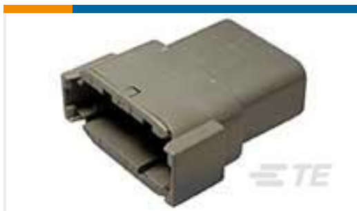
TE Part #DTM04-12PA REC, 12P, GRY, N, A