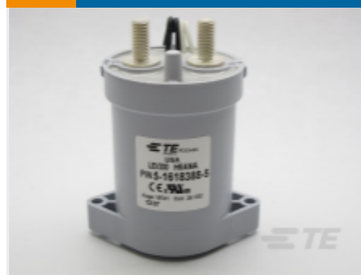
TE Part # 2-1618393-6 LEV200H6ANA=RELAY, SPST-NO