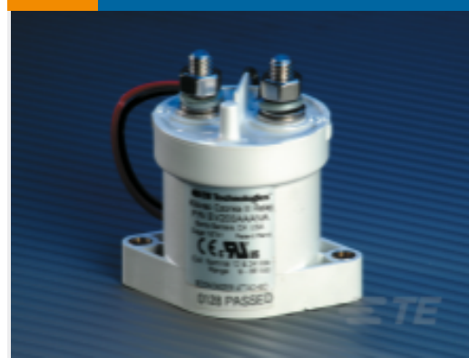
TE Part # 2-1618002-0 EV200HJANA=RELAY, SPST-NO WITH