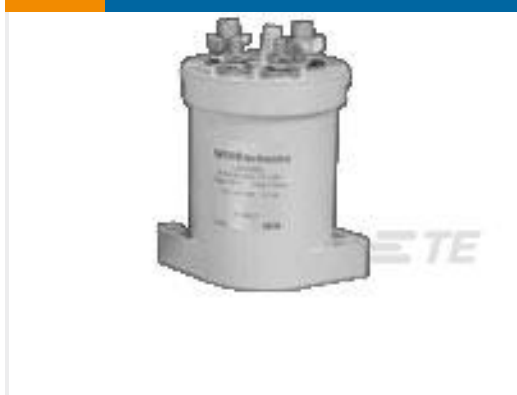
TE Part # 1618387-7 LEV200A4NAA=RELAY, SPST-NO