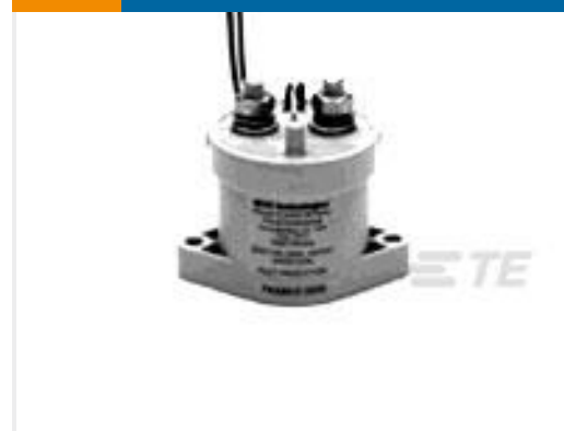
TE Part # 1-1618002-9 EV200HDANA=RELAY, SPST-NO