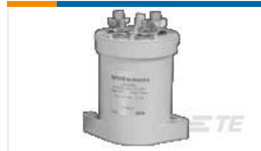
TE Part # 9-1618389-8 LEV100A5ANG=RELAY, SPST, 24Vdc