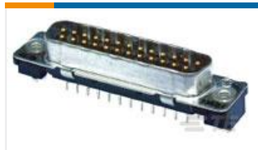
TE Part #3-338309-2 9POS.HD20 PLUG ASSY