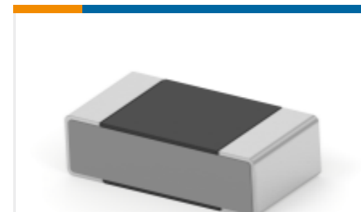
TE Part #8-1879417-3 CPF0603 887K 0.1% 25PPM 1K RL