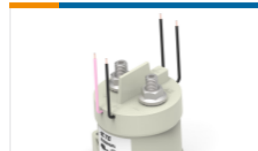
TE Part #1-2071567-2 ECK200AAAPA