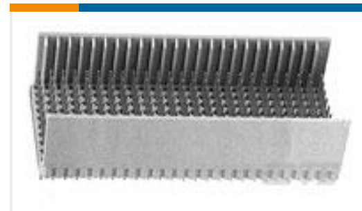
TE Part #5646347-1 2MM HM,ASY,T-E,HDR,08R,200,AP