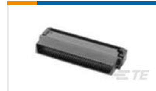
TE Part #5390377-5 50 POS A/P PLUG 25 CL 30AU