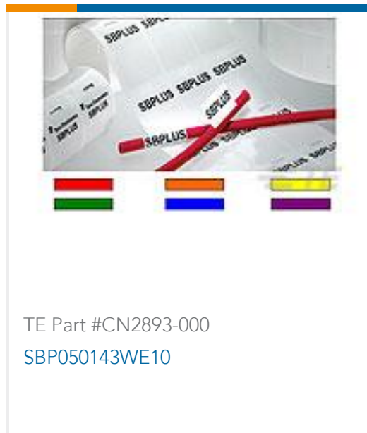
TE Part #CN2893-000 SBP050143WE10