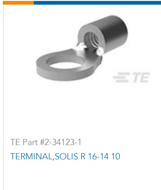
TE Part #2-34123-1 TERMINAL,SOLIS R 16-14 10