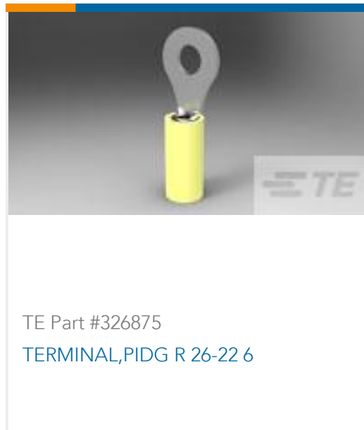
TE Part #326875 TERMINAL,PIDG R 26-22 6