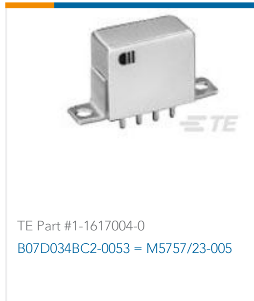
TE Part #1-1617004-0 B07D034BC2-0053 = M5757/23-005