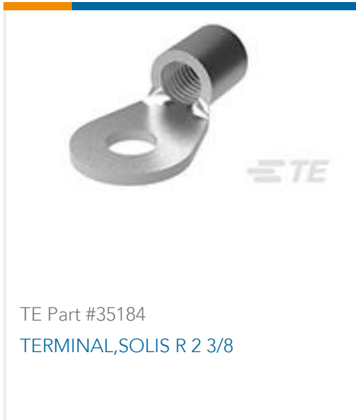
TE Part #35184 TERMINAL,SOLIS R 2 3/8