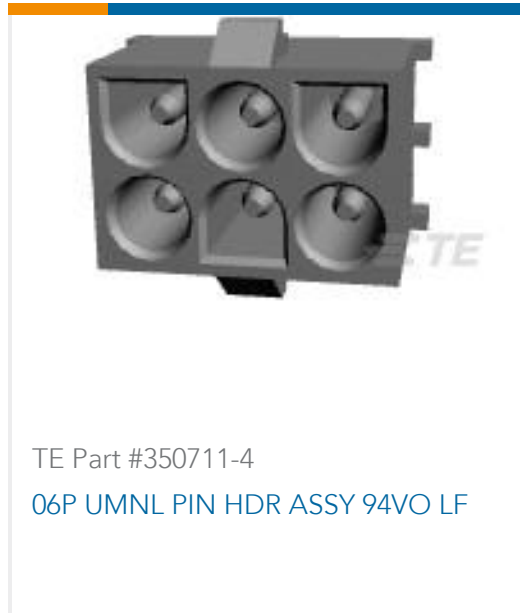
TE Part #350711-4 06P UMNL PIN HDR ASSY 94VO LF