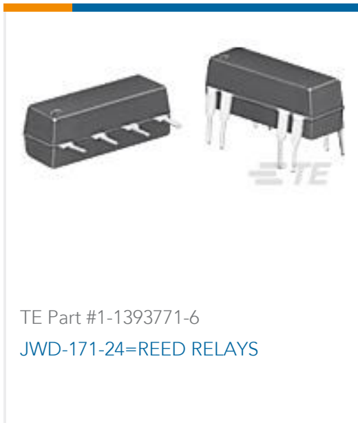
TE Part #1-1393771-6 JWD-171-24=REED RELAYS