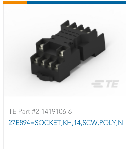
TE Part #2-1419106-6 27E894=SOCKET,KH,14,SCW,POLY,N