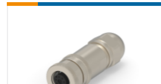
TE Part #T4110012041-000 M12 F, 4P GOLD A_CODE S SHIELDED PG9