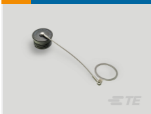
TE Part #YDTS32W23NV0010000 DUST COVER ASSEM