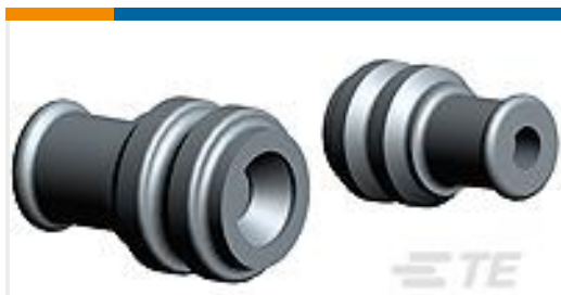
TE Part #2098582-1 WIRE SEAL,RUBBER,SENSOR, RED