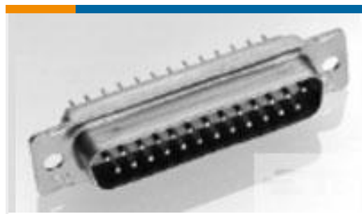
TE Part #1757820-9 AMPLIMITE,ASY,RCPT,STD,109,ZN,4, CT